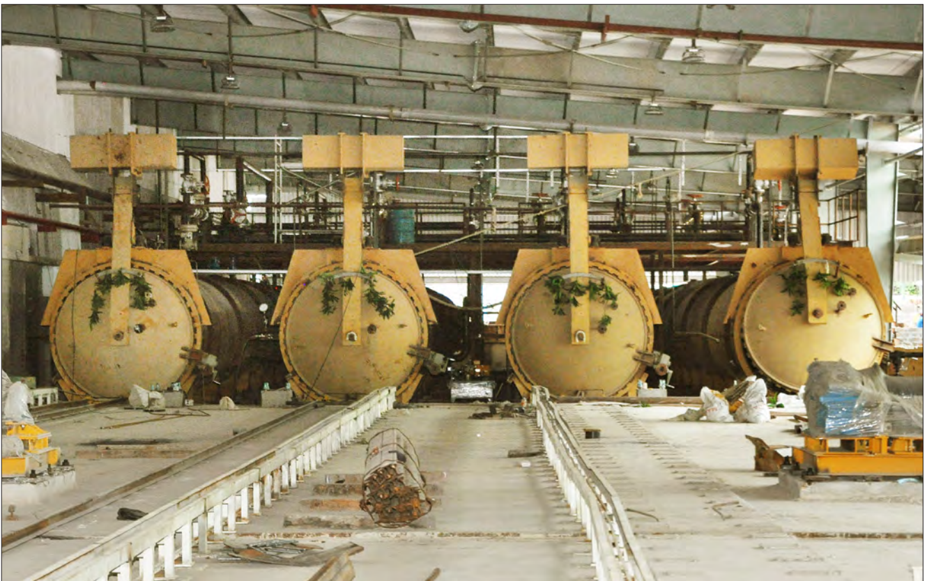
Arakkonam Unit Line 2 - Autoclaves