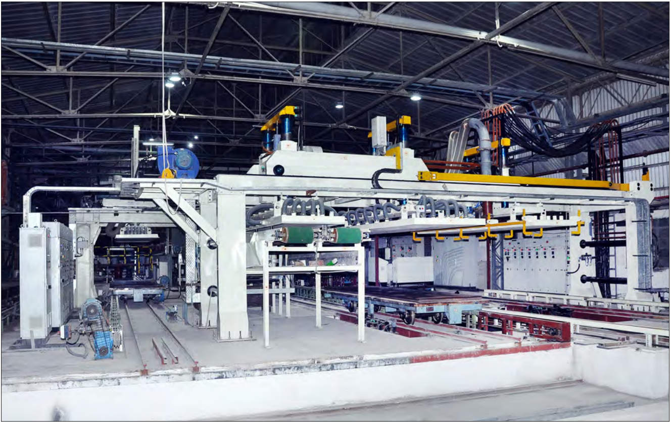
Arakkonam Unit Line 2 - Destacker & Template Piler