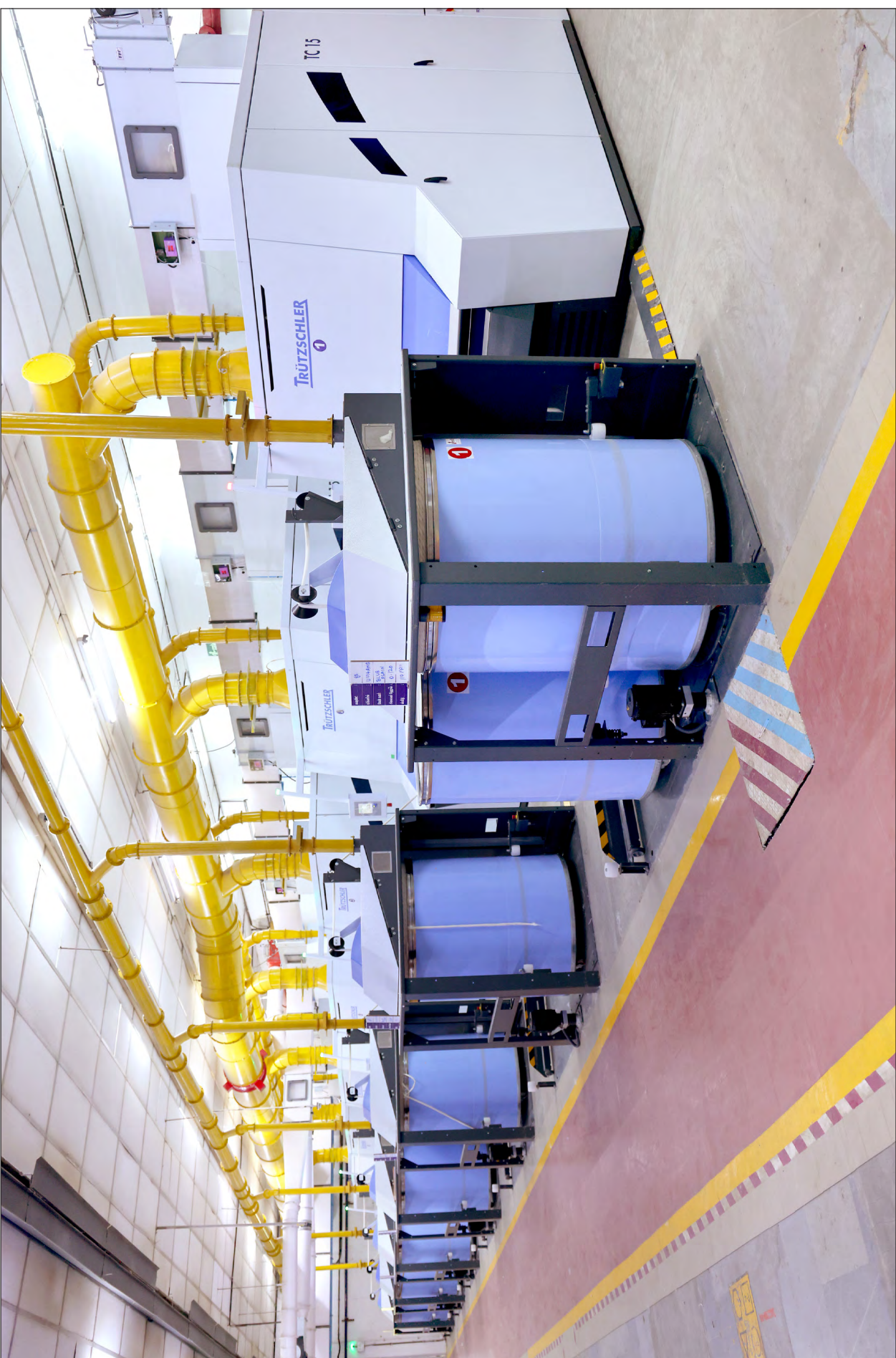
Trutzschler TC 15 model Carding Machine