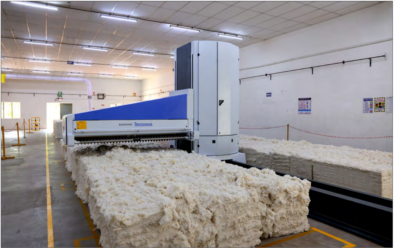
Automatic Bale opener installed in blowroom