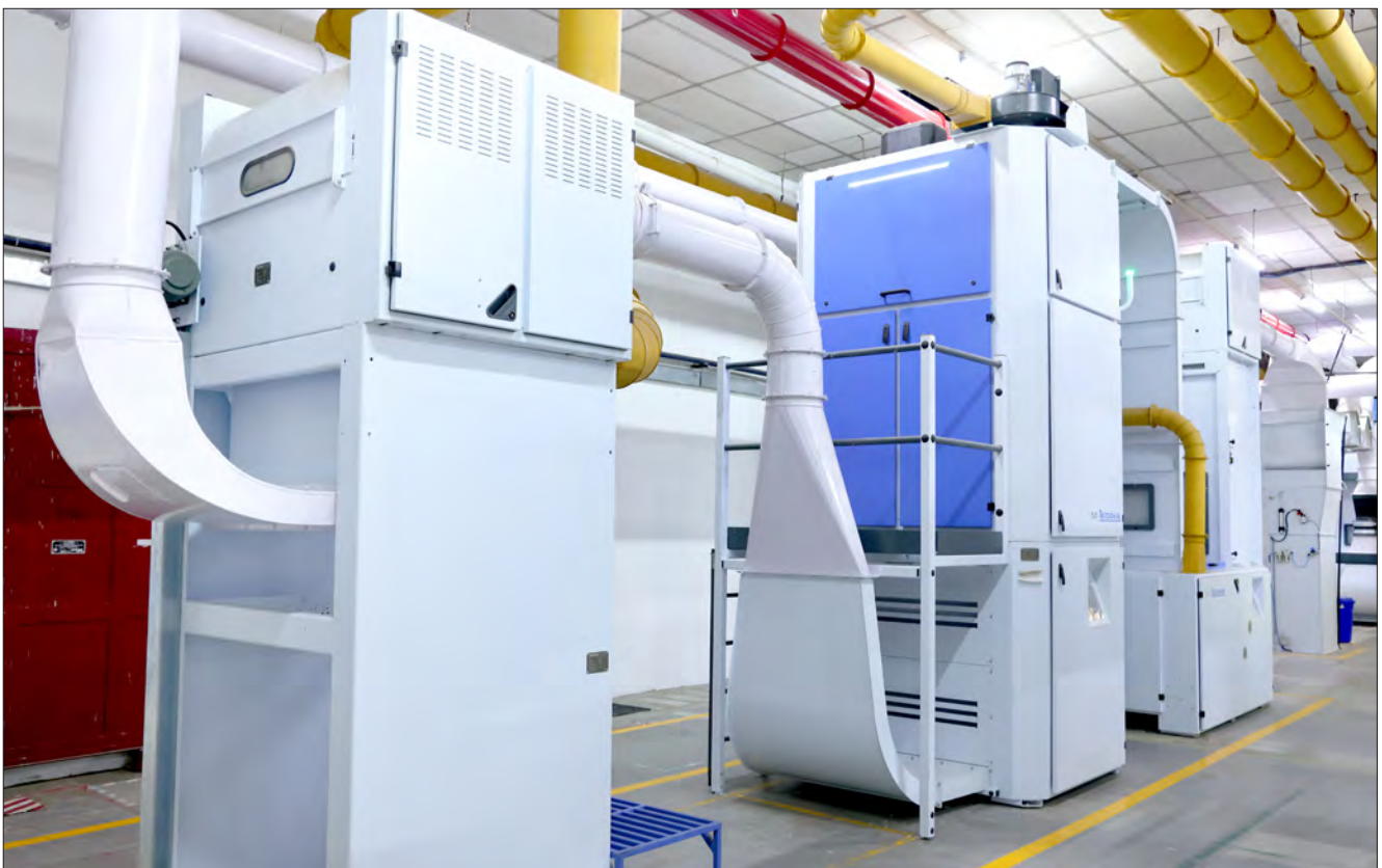
Trutzschler blowroom machines and Contamination detector