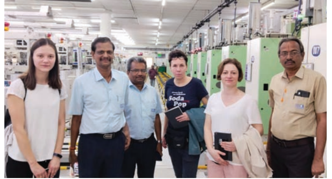
Our Executives with Export Customers from Poland during their visit to Rajapalayam Mills.