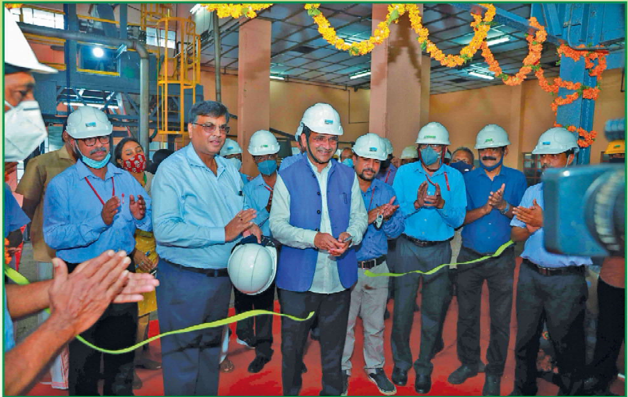
Shri Bhagwanth Khuba, Hon'ble Union Minister of State for Chemicals & Fertilizers and New & Renewable Energy, Govt. of India rededicating the Caprolactam plant to the Nation