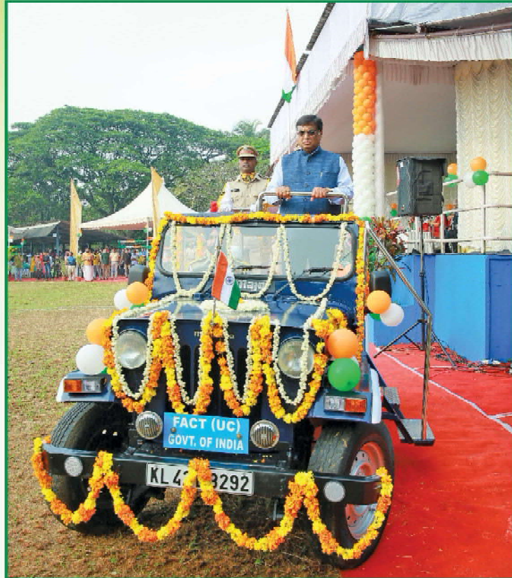
Independence Day Parade inspection by Shri Kishor Rungta, CMD