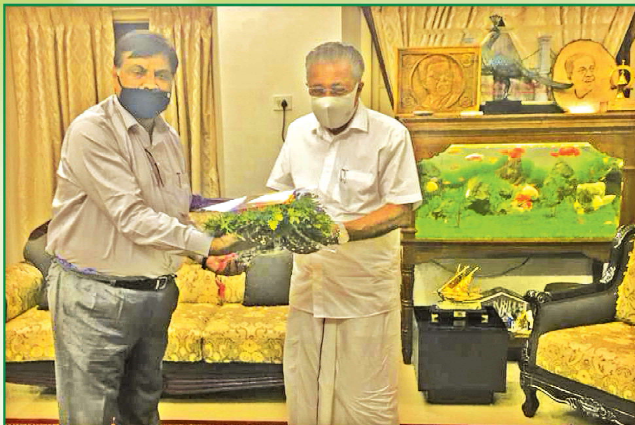
Shri Kishor Rungta, CMD meeting Shri Pinarayi Vijayan, Hon'ble Chief Minister of Kerala at Thiruvananthapuram