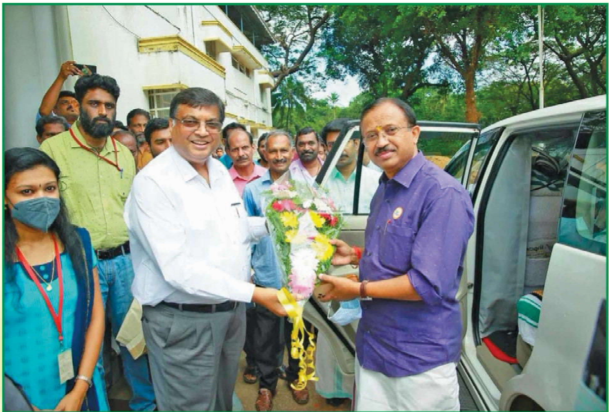
Shri Kishor Rungta, CMD receiving Shri V Muraleedharan Hon'ble Union Minister of State for External Affairs & Parliamentary Affairs, Govt. of India