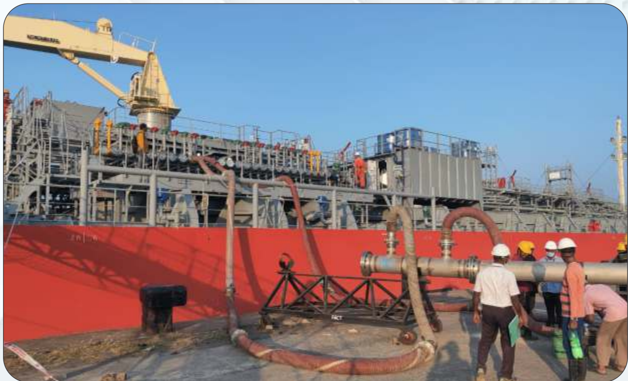
First 'Phosphoric Acid Ship' unloading from Q9 berth