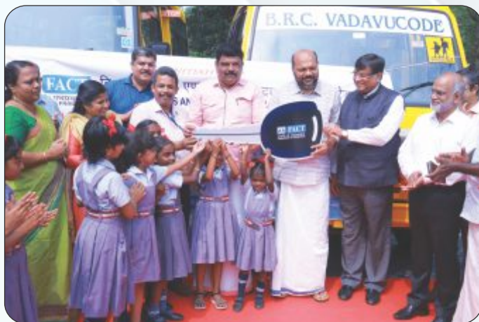
School Bus for BUDS School, Vadavucode & Govt. LP School, Eloor