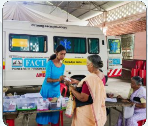
Mobile Health Unit