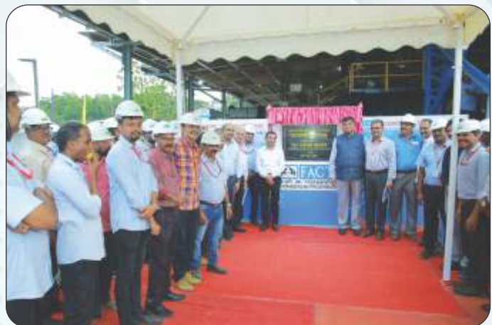
Renovated Ammonium Sulphate Bagging Section

As a part of the infrastructure developments in association with fertiliser capacity expansion project, two new Sulphuric Acid tanks at the Cochin division were commissioned.