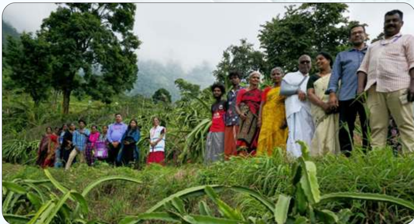
Promotion of Organic Fertilizers, Phosphate rich Organic Manures (PROM) and Potash derived from Molasses (PDM) under PM - PRANAM initiative of Government of India. Farmers meeting conducted in Dragon Fruit field in tribal Village Agali in Palakkad district (Kerala).