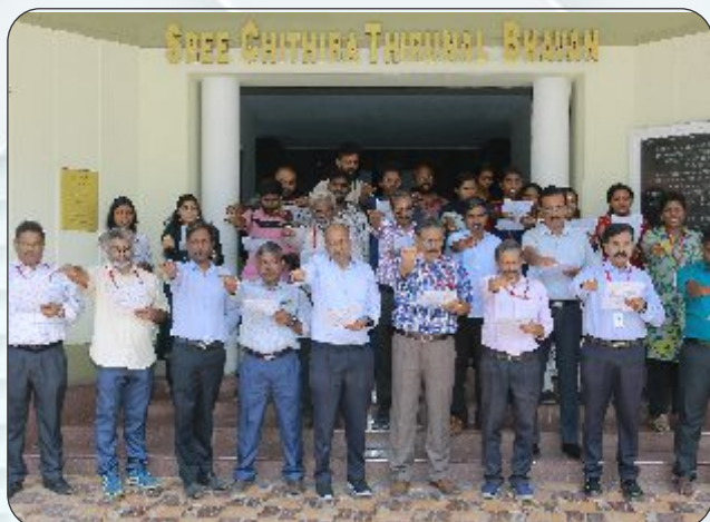
Pledge on the Occasion of Productivity week celebrations