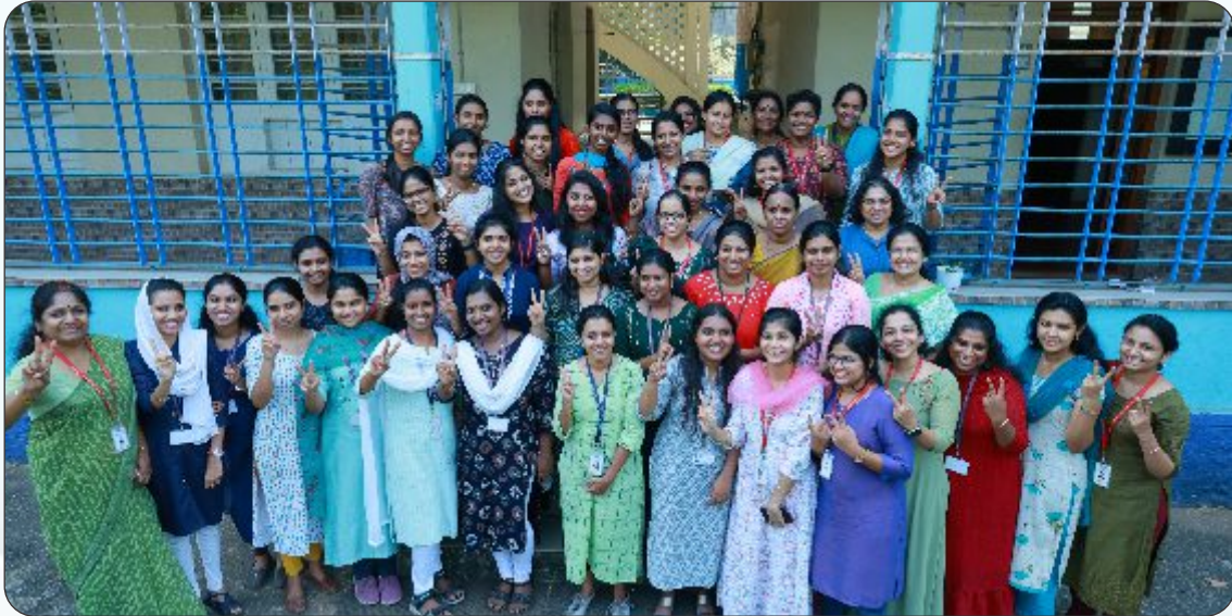
Women's Day Celebrations held at FACT