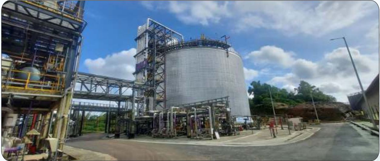
New Ammonia Storage Tank project at Cochin Division