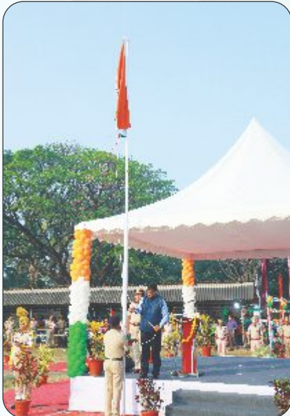
Former CMD Shri. Kishor Rungta unfurling the National Flag at the Republic Day Celebrations