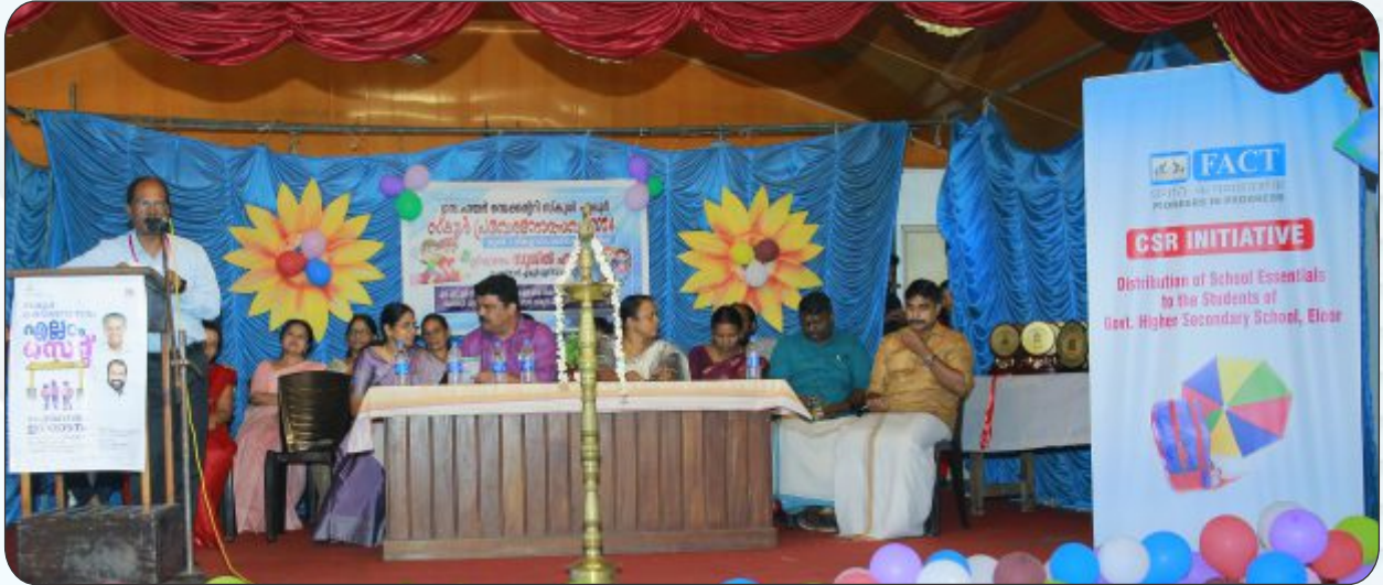
FACT distributed school essentials to the students of GHSS, Pathalam as part of its CSR initiative.