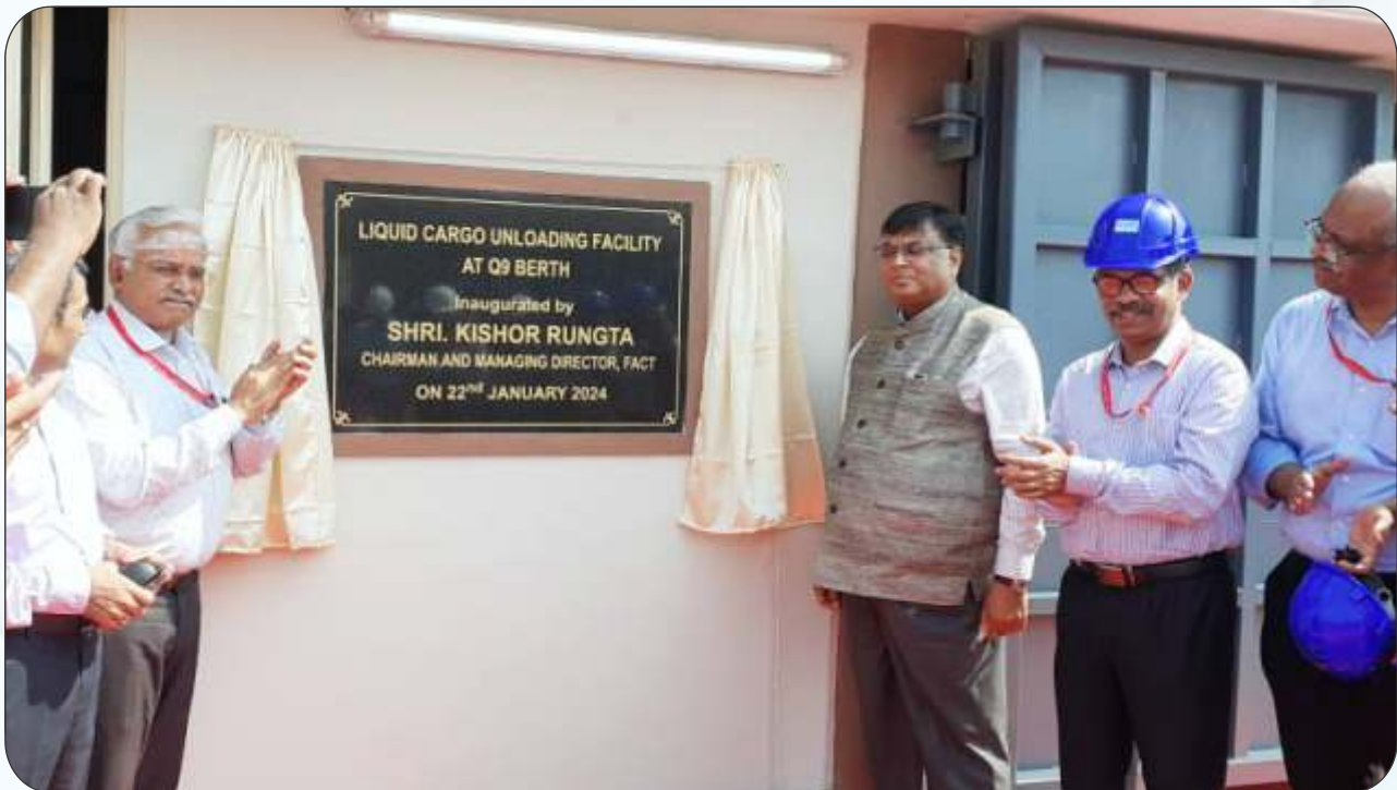
Inauguration of the Liquid Cargo Unloading Facility at Q9, Cochin Port