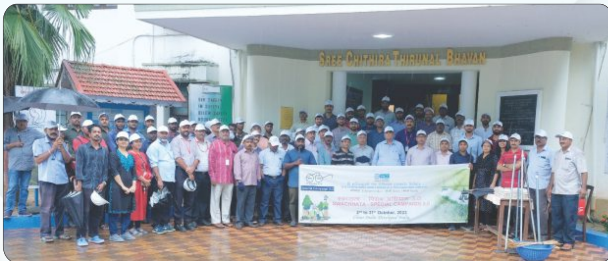
Cleanliness Drive held aty FACT in connection with Swachatha Special Campign 3.0