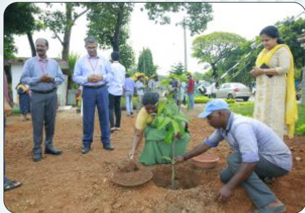
Ms. Soorya Thankappan, IPS planting a sapling at FACT Township in connection with the World Environment Day Celebrations