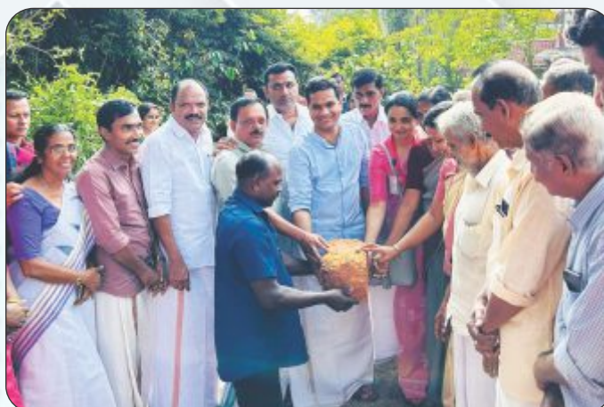
Foundation Stone laying of Smart Anganwadi at Karumalloor