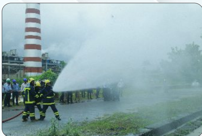
A view of Mock Drill

FACT & Oil India limited signed a MoU to explore green hydrogen, decarbonisation & clear energy initiatives, paving the way for a sustainable future.