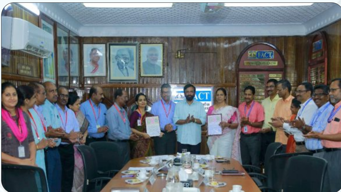
FACT & CUSAT signed MOU to institute the "FACT Chair Professor" in the Dept. of Safety & Fire Engineering, CUSAT