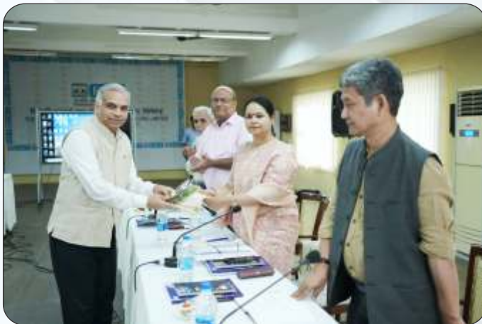
Visit of Secretary, National Commission for Scheduled Tribes (ST) to FACT on 29.02.2024