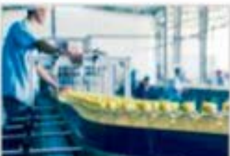
Bottling, Canning & Packaging