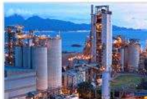
Cement, Mining & Minerals