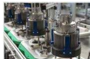
Industrial Electrical (Electric Motors & Circuit Breakers)