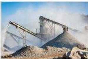
Cranes & Conveyors