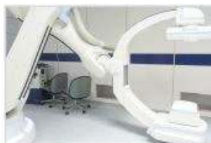
Medical (X-Ray & Imaging Equipments)