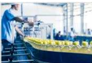
Bottling, Canning & Packaging