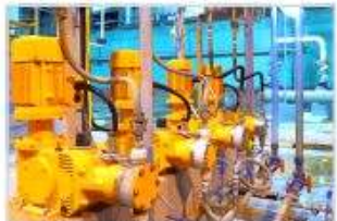
Fluid Machinery (Pumps, Fans & Blowers)