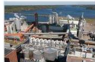
Process Industry (Fertiliser, Sugar, Paper & Pulp)