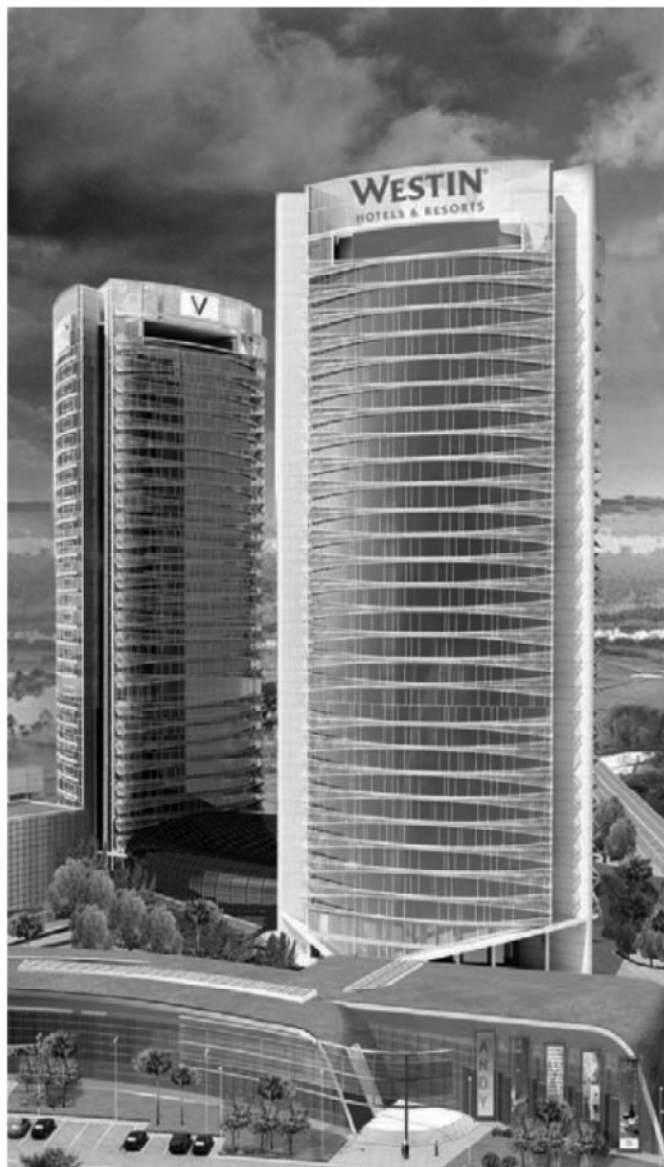
Westin Hotel and The V, Kolkata, West Bengal