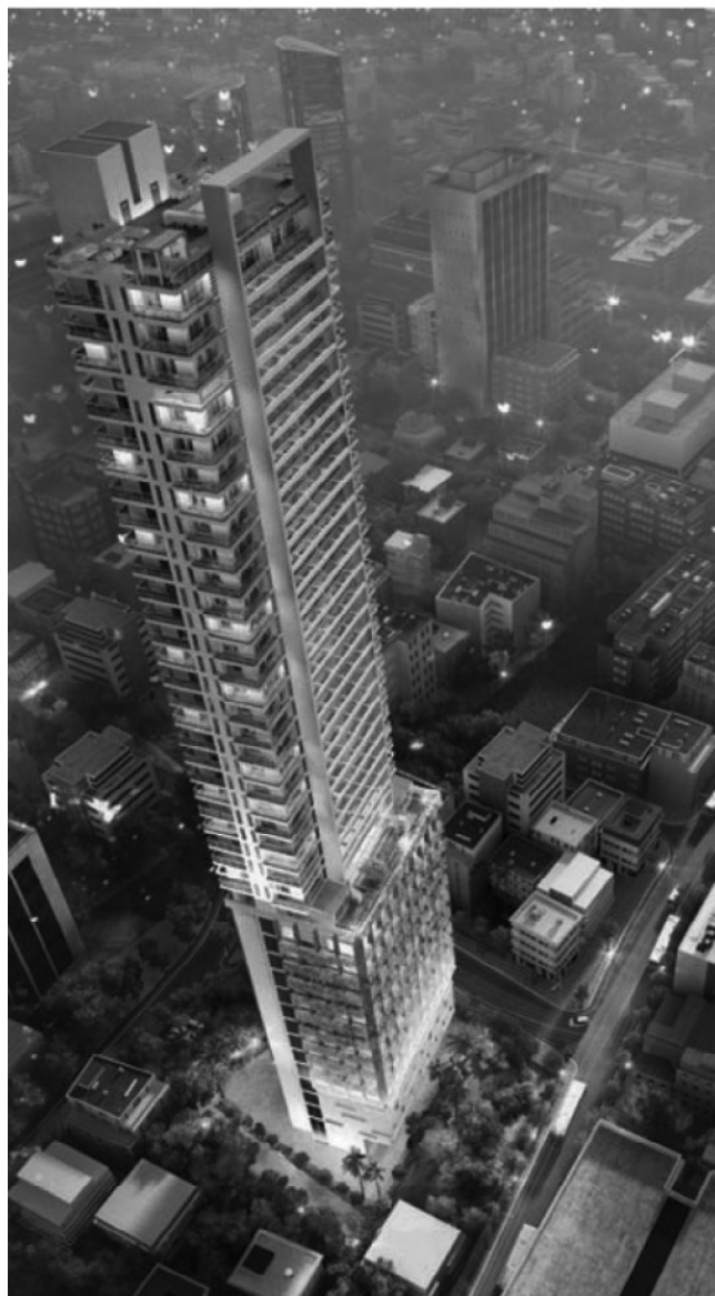
Shristi Sea View, Mumbai, Maharashtra