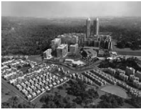
Shristinagar - Asansol