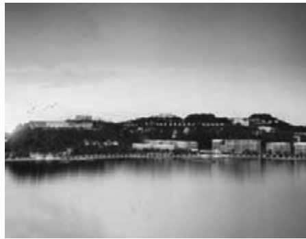
Shristinagar - Guwahati