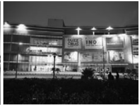
Sentrum Mall, Shristinagar - Asansol