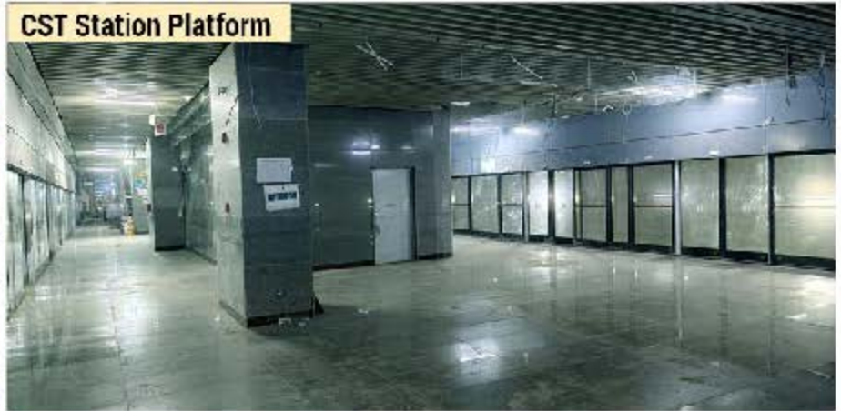
CST Station Platform