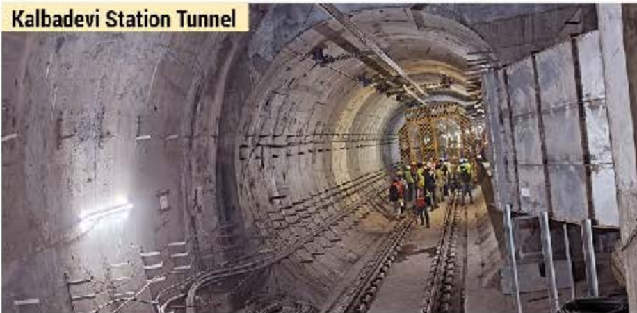
Kalbadevi Station Tunnel