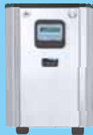
Zero B Intello