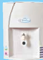
Zero B Eco RO