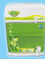
Zero B Solar

7-stage RO Water Purifier • Heptapure Technology removes bacteria, viruses, pesticides, harmful chemicals, heavy metals & other physical impurities from water • Equipped with Activated Bacteriostatic Carbon • Gives energized water for healthy & active life • Improves the taste of pure water & makes it sweeter • Resin carbon cartridge acts as a back up for double purification • High capacity membrane helps the tank to fill up fast • Stylish and elegant looks • Membrane life enhanced by automatic cleaning at regular intervals Product water meets international USEPA drinking water standards and IS 10500