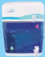
Zero B Sapphire