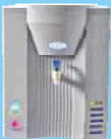
Zero B Pristine