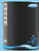
Zero B Kitchen Mate