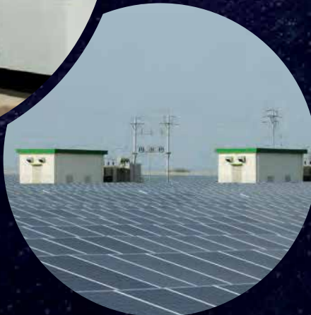
Solar Plant at Solapur