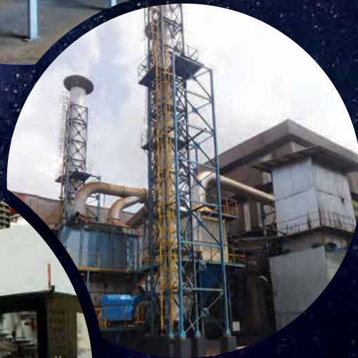
De dusting equipments at Koppal plant