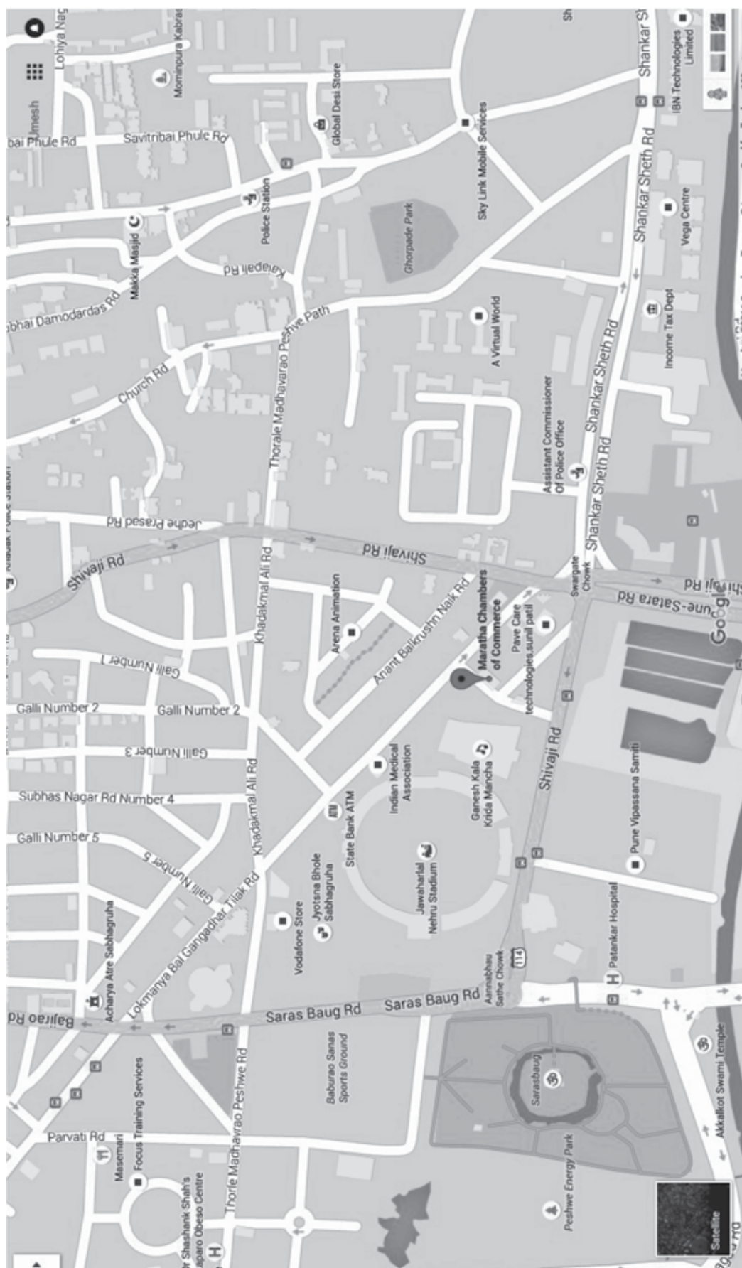
Route Map of the venue of the Annual General Meeting