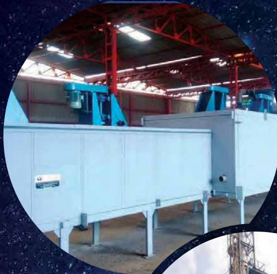
LPG Core Oven at Solapur Plant