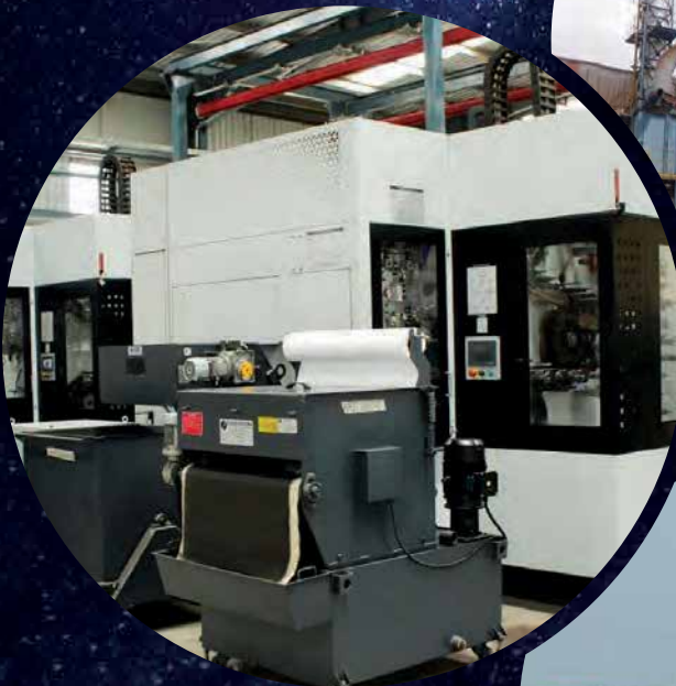
Machine Shop at Koppal Plant