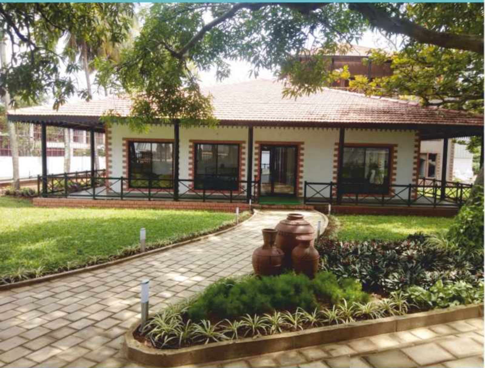
New Factory Administrative Office