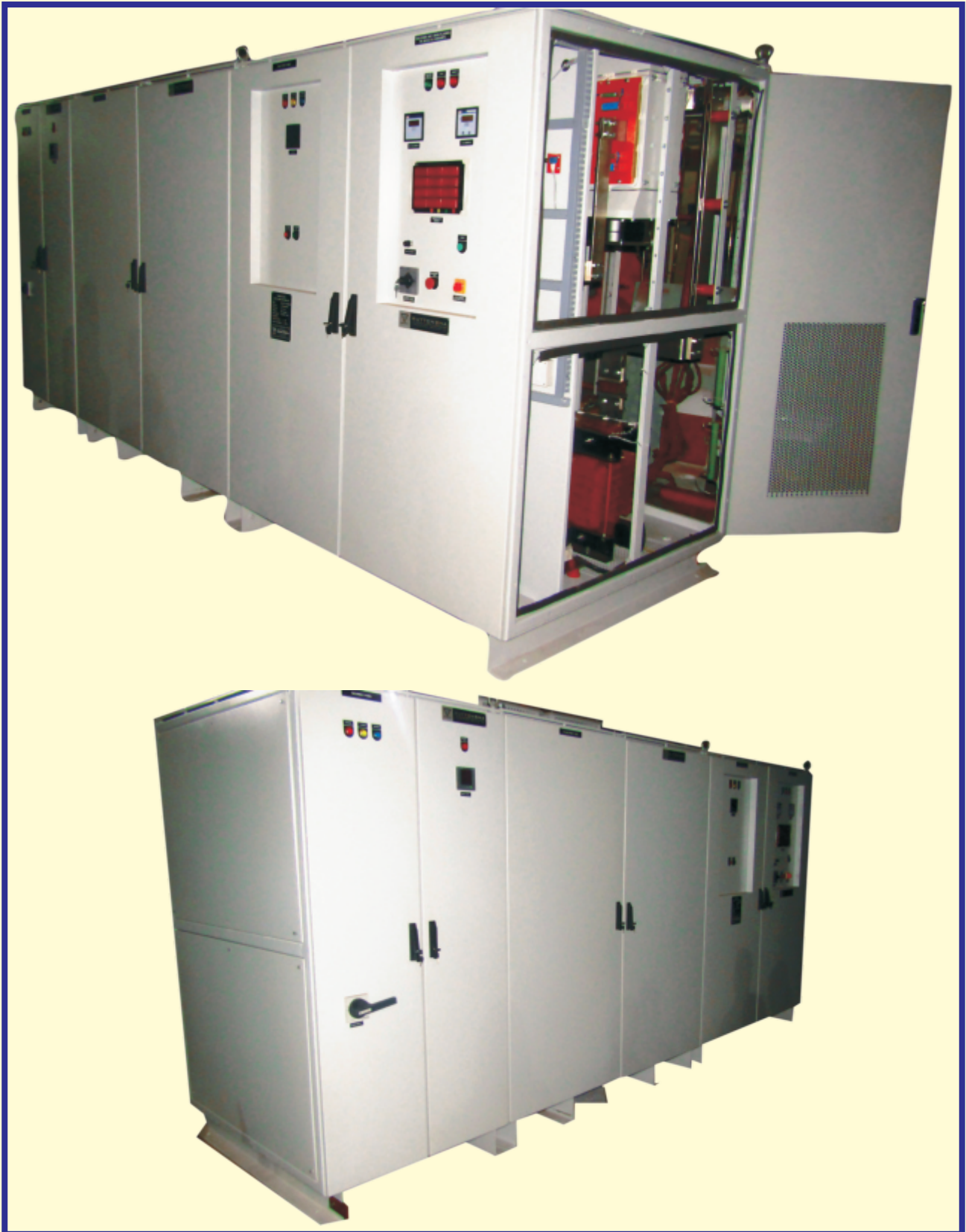
90V 4000A PLASMA RECTIFIER