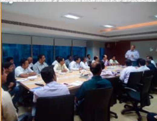
"Internal Brand Building" - way of working at Anjani Cement