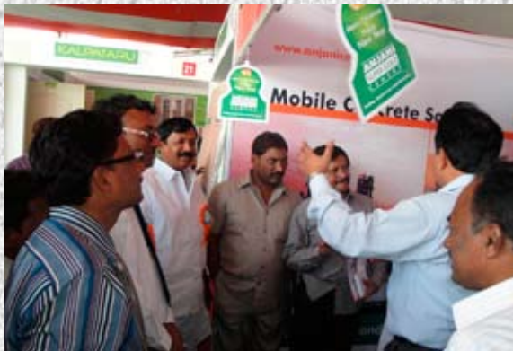
Anjani in Maharashtra State - Participation in exhibition at Solapur.