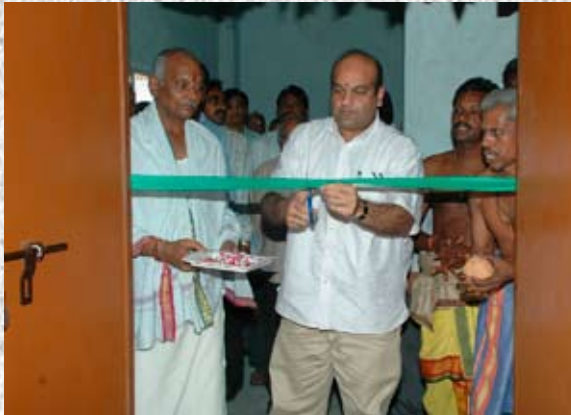
Dr. BV Raju Institute of Cement Technology Vajinepalli, Near Anjani factory