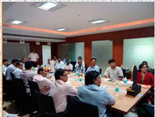
Homage to Founder Chairman - Launching of Dr. B V Raju Memorial Scheme for Anjani Cement dealers.