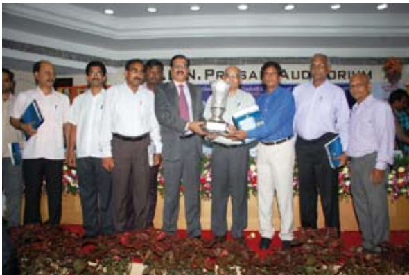
Anjani Cement Executives Received FAPPCI "Excellence Award for Corporate Social Responsibility" from Honorable Chief Minister of AP, Sri. Kiran Kumar Reddy on 28.07.2011