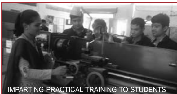
IMPARTING PRACTICAL TRAINING TO STUDENTS