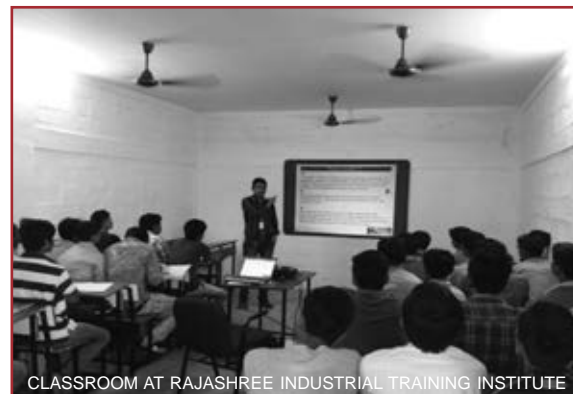
CLASSROOM AT RAJASHREE INDUSTRIAL TRAINING INSTITUTE

Skill Development has become a critical national agenda and is a primary requirement for channelising the youth and to support industrial growth. The Company continued its support in the establishment of a Government recognised Vocational Training Institute near its Bharuch site (Gujarat). The institute completed its first phase as per schedule with state-of-art facilities for practical training and commenced first academic session in August 2015 with about 40 students under two trades. The construction work for phase two had already begun and three more trades are slated to begin in August 2016 and expecting students strength to increase substantially.