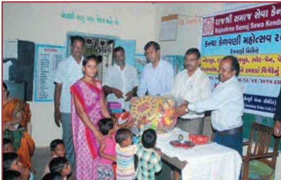
DISTRIBUTION OF STUDENT STATIONERY