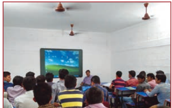
RAJASHREE INDUSTRIAL TRAINING INSTITUTE