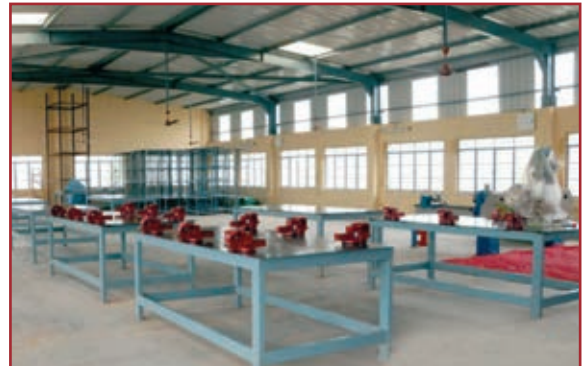
WORKSHOP AT RAJASHREE INDUSTRIAL TRAINING INSTITUTE