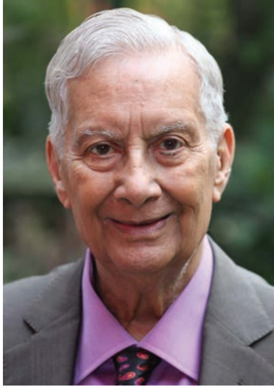
Mr. B.K. Birla - Chairman