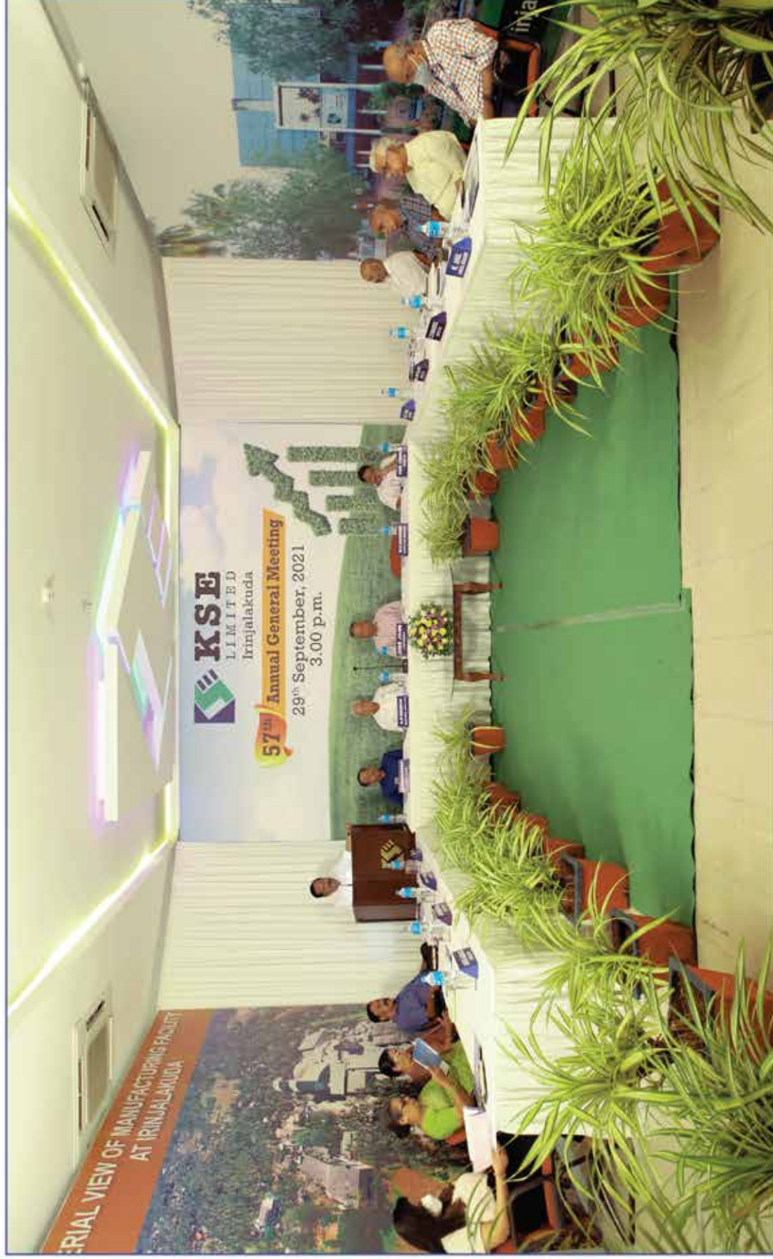
57 th Annual General Meeting in Progress