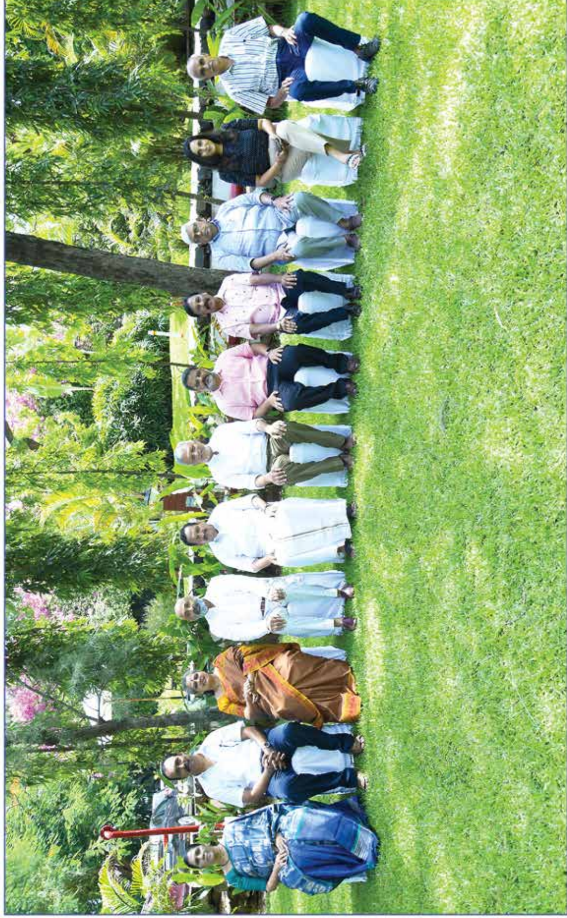
Board of Directors