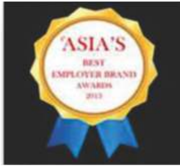
Asia's Best Employer Brand Award for Talent Management, 2011 & 2013