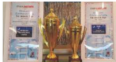
Recognized as "Dream Companies To Work For 2017" at the silver jubilee ceremony of World HRD Congress.