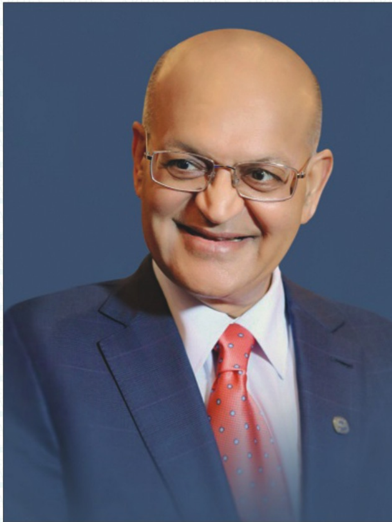
Hon'ble Shri Abhey Kumar Oswal