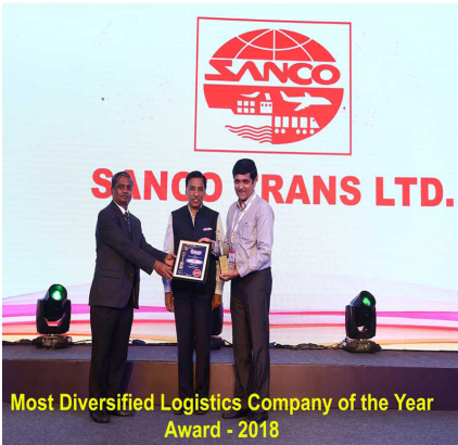
Most Diversified Logistics Company of the Year Award - 2018