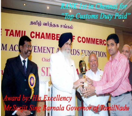
Award by: His Excellency Mr. Surjit Singh Barnala Governor of Tamil Nadu