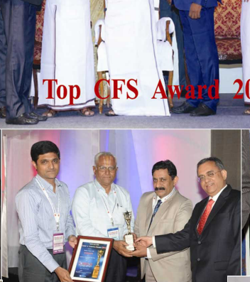
Top CFS Award 2018