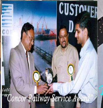
"Concor Railway Service Award"