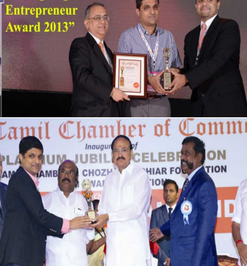
"Young Logistics Entrepreneur Award 2013"