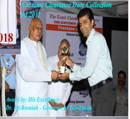
Award by: His Excellency Dr. Mr. Rosaiah - Governor of Tamil Nadu