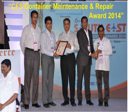
"CFS Container Maintenance & Repair Award 2014"