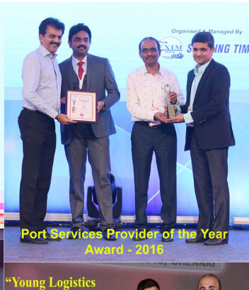
Port Services Provider of the Year Award - 2016