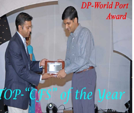
DP-World Port Award