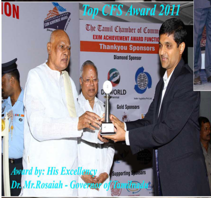
Award by: His Excellency Dr. Mr. Rosaiah - Governor of Tamil Nadu