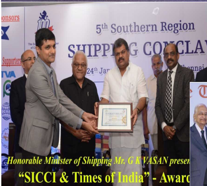
Honorable Minister of Shipping Mr. G.K. VASAN presents "SICCI & Times of India" - Award