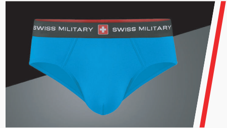
Tequila Black Band Briefs