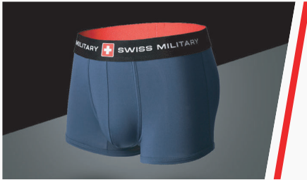
Baracuda Black Band Square Drawers