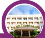
VITS Ankleshwar Valia Road, Ankleshwar