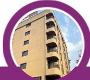
VITS Select Kharadi Pune Sr No 121/B, near Eon Free Zone Road