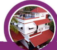
VITS Select Ratnagiri DYS Plaza, Maruti Mandir, Ratnagiri