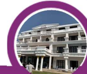
VITS Dapoli Karde Beach, Dapoli, Maharashtra