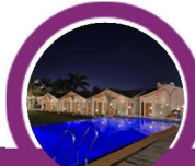
VITS Daman Devka Beach Devka, Nani Daman