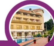
VITS Kamats Silvassa VITS Kamats Silvassa