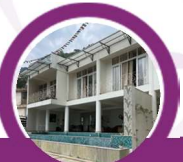
VITS Gangtok Unit No.09, road, Luing, Gangtok, Sikkim 737101