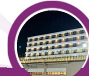
VITS Karad Pune-Bangalore Highway, Karad