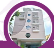
VITS PB Aurangabad behind RTO Office, opp. Vedant Nagar Police Station