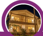
VITS Select Diveagar Talani Naka Beach Road, Diveagar