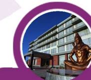
VITS Select Somnath Prabhas Patan, Somnath