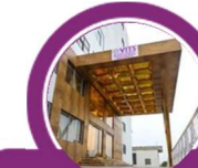
VITS Nanded Canal Road, Near Dmart, Nanded