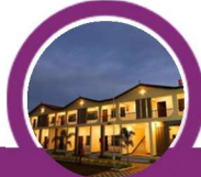
VITS Sasan Gir Borvav Dhava Rd, near umiya Sankul