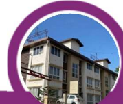
VITS Panchgani Mahu Dam Road, opposite of Ganesh Mandir