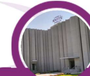
VITS Jamnagar Nayara Refinery Gate, Jamnagar