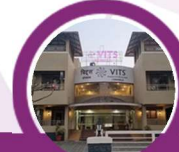
VITS Lonavala Old Mumbai - Pune Highway