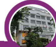
VITS Sharanam Thane Teenhath Naka, Thane (W)