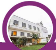
VITS Bharuch Opposite Railway Station Road, East, Bholav