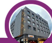
VITS Dwarka Okha State Highway, Dwarka