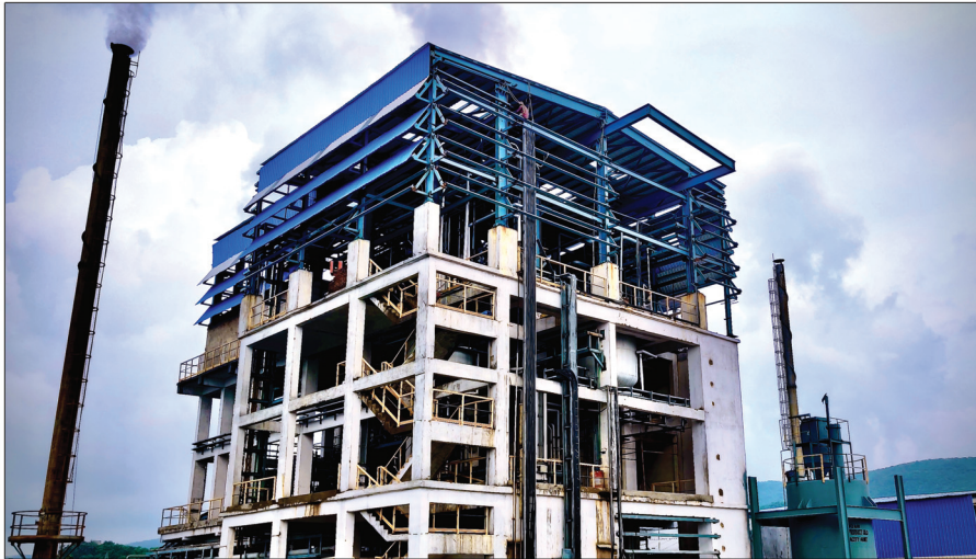
New Aluminium Fluoride Plant Building