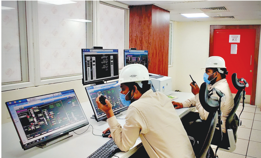
State-of-the-art Central Control Room with the latest Distributed Control System