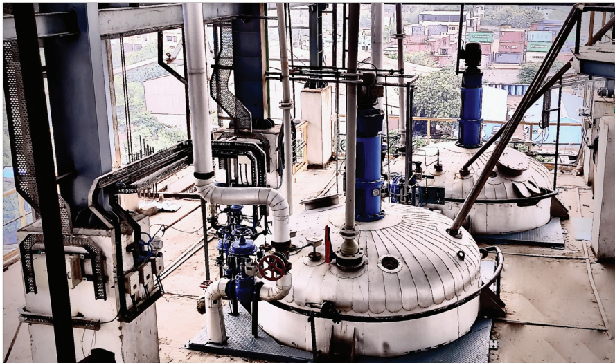
New Aluminium Fluoride Crystallizers