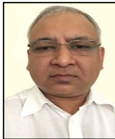
Shri Sudhir Jhunjunwala