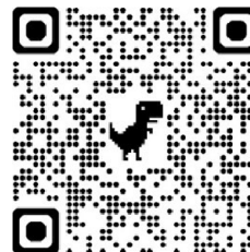
Notice of 41st AGM

Note : This being computer generated letter, no signature is necessary.