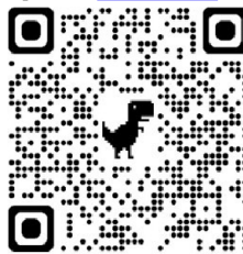
Annual Report 24-25