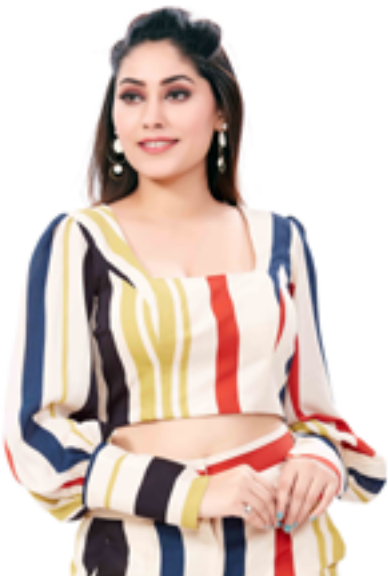
Ira: The Ira brand is represented by smart formal and casual wear that is affordable.