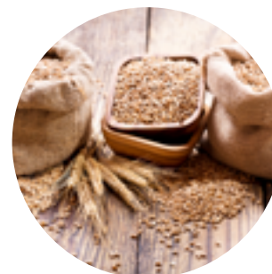
Agri supply chain business