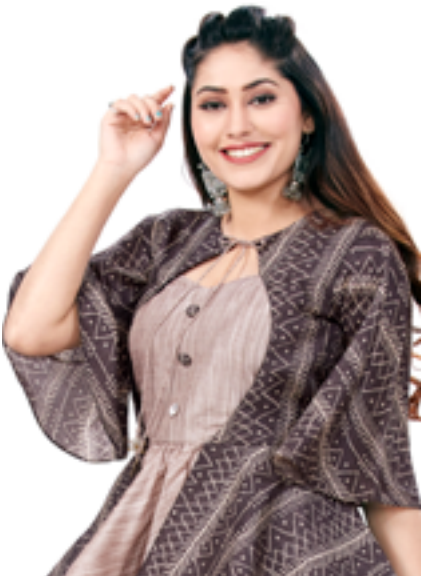
Ekaa: This range reconciles traditional Indian fabrics and contemporary designs, directed towards bold customers seeing to experiment.