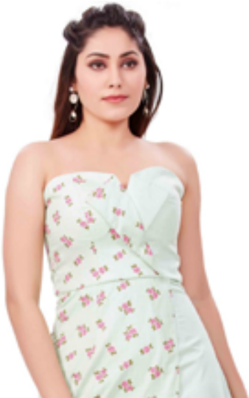
Tag9: This range is designed using imported fabrics and natural dyes provide a rich and elegant look.