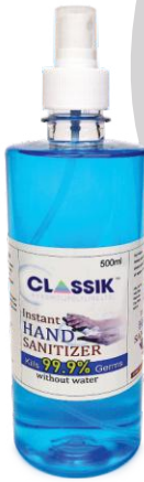
500 ml (Mist)