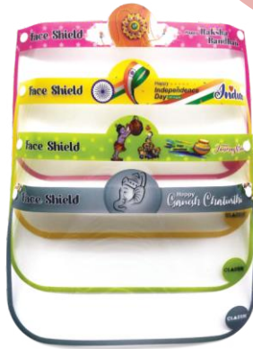
Festival Face Shield