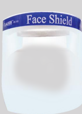
FS 111 (Regular & Big)