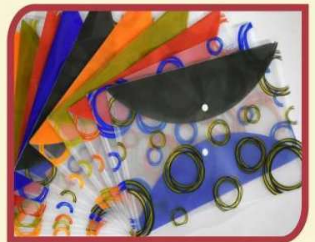
Printed My Clear Bag