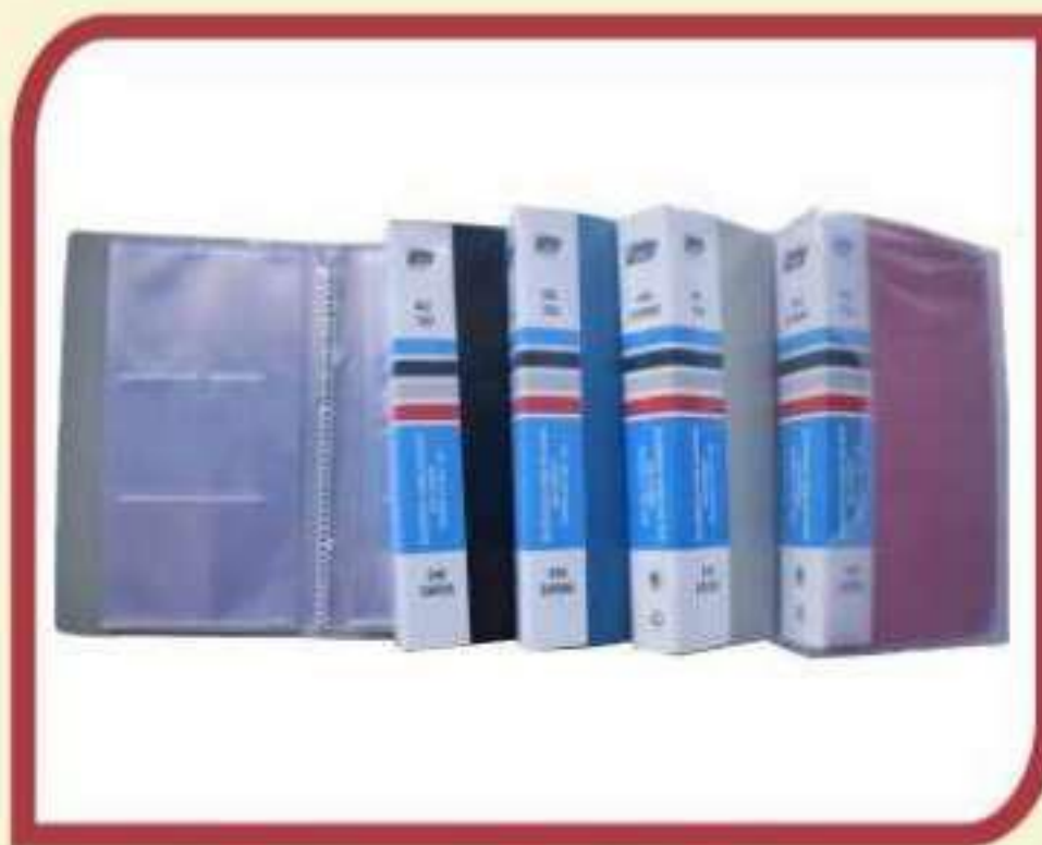
Visiting Card Album