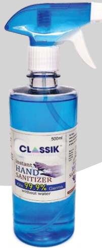
500 ml (Trigger)