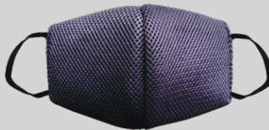
Fabric Face Mask