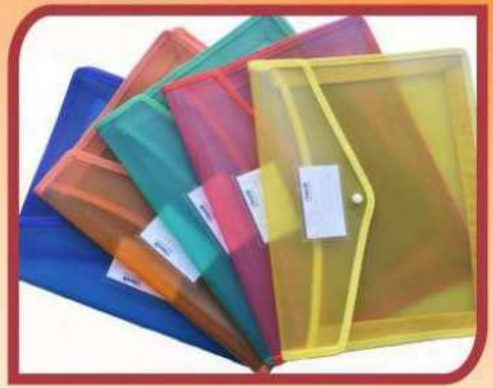
Button Folder Bag