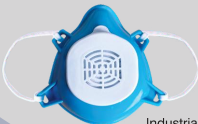
Industrial Face mask