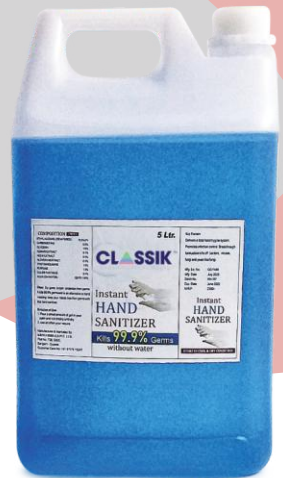
5 Liter Hand Sanitizer