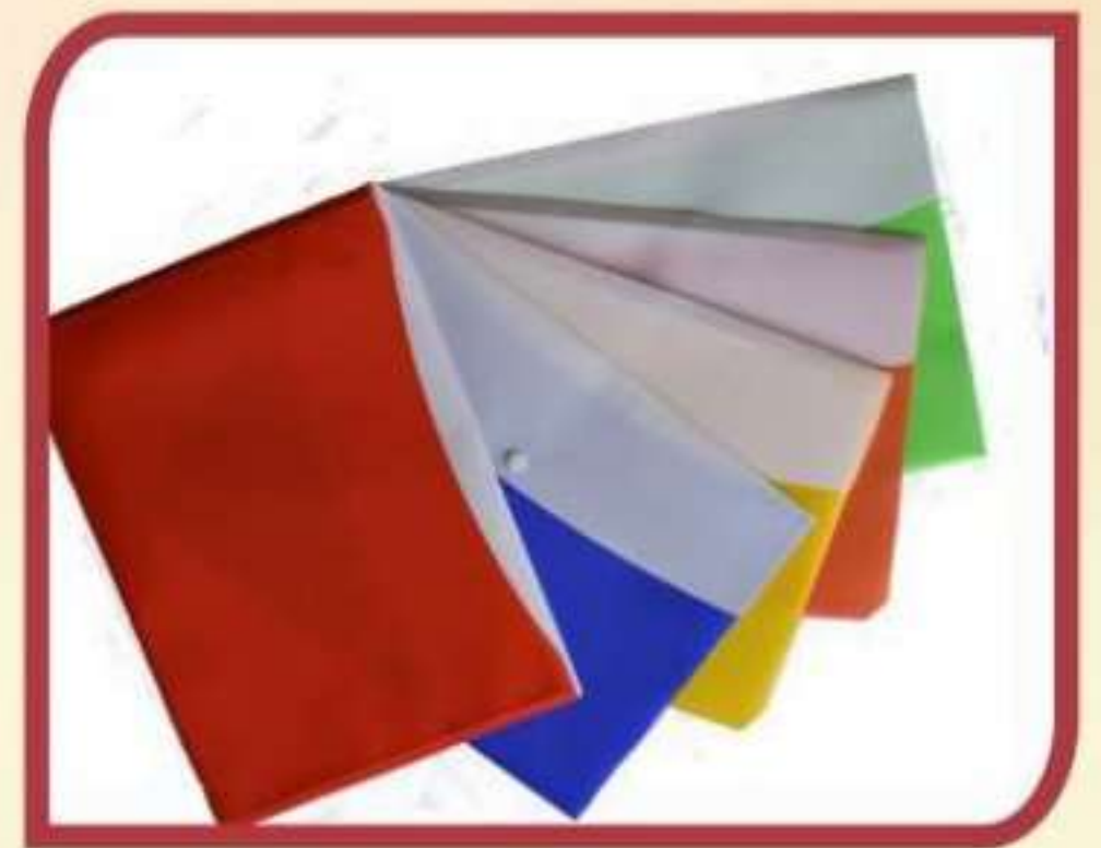
My Clear Bag-Twin Packet