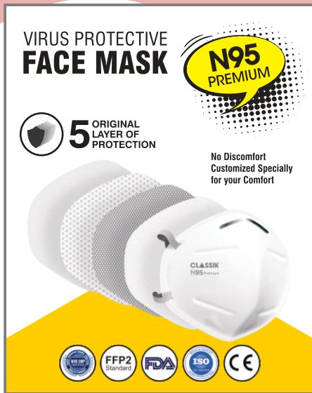
N95 Premium Face Mask