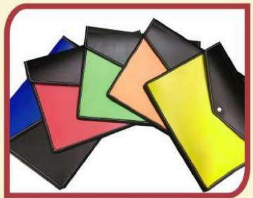
Button Folder Opeque Colour

25% Discount on MRP. for all our shareholders