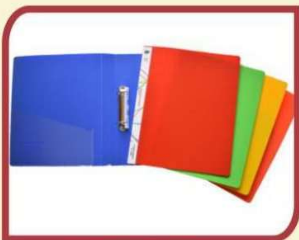
2 D Ring File