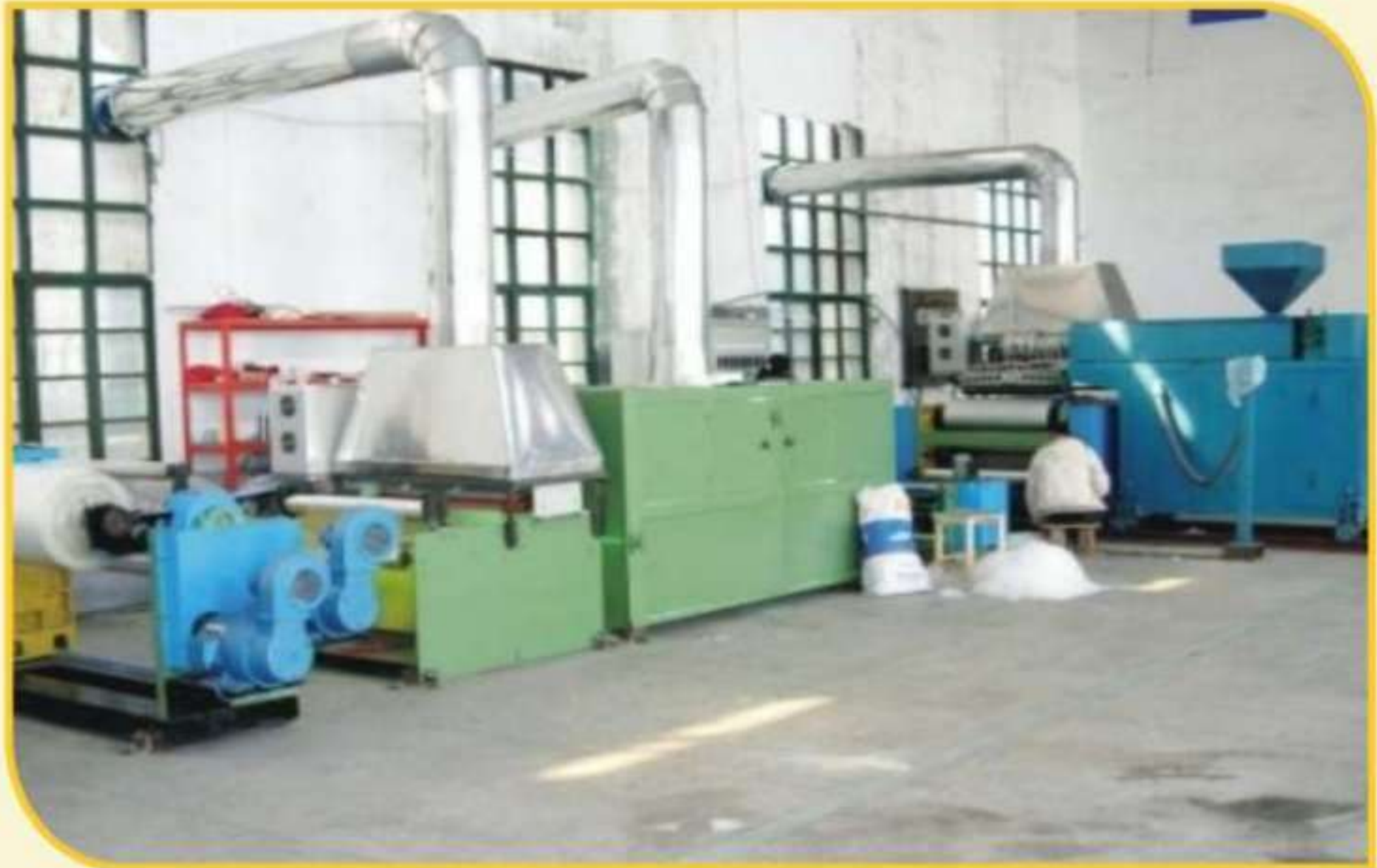
Lamination Film Manufacturing Machine