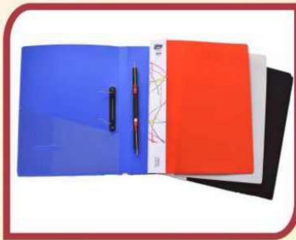
Cobra / Spring File