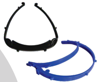
Face Shield Band