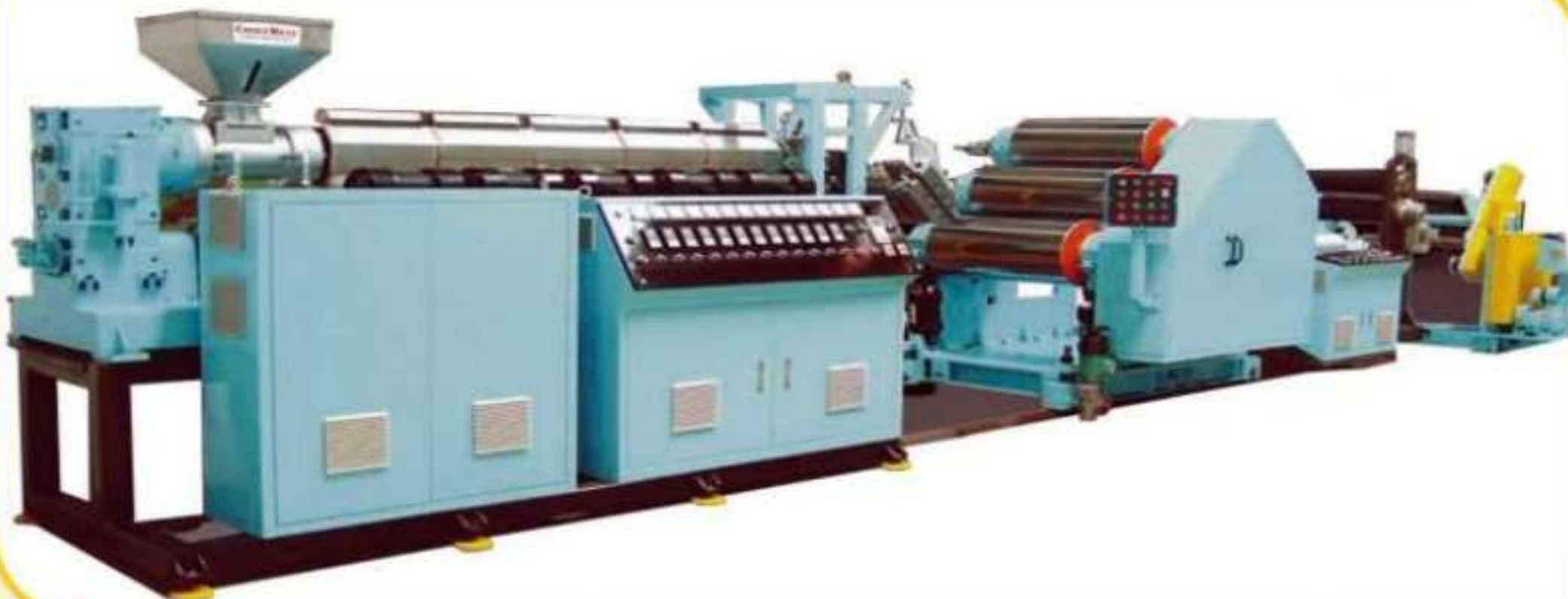
PP Film / Sheet Manufacturing Machine