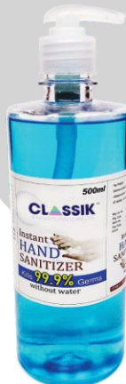
500 ml (Dispenser)