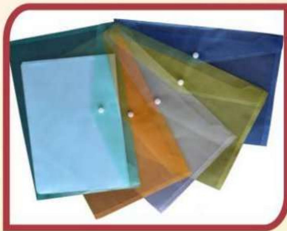
Transperant My Clear Bag