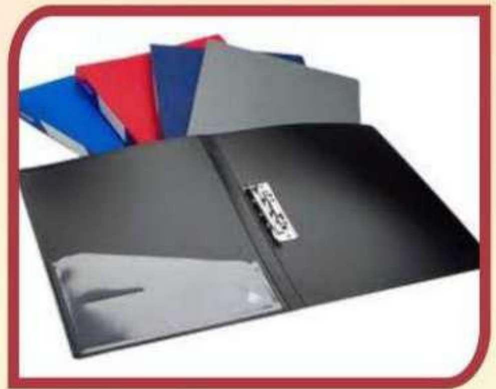
Timex / Punchless File