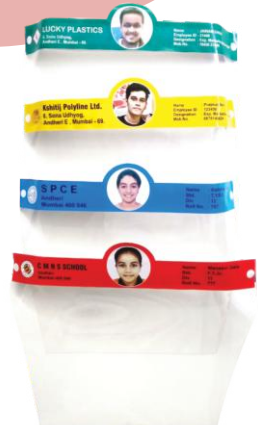
Customized Face Shield for School, Collages, Corporates etc.