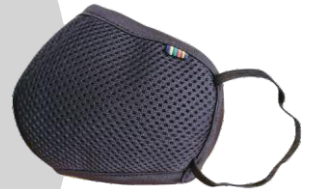
Fabric Face Mask