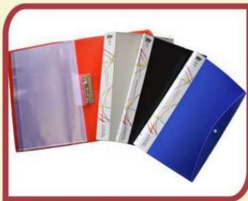
Display File with Timex Clip