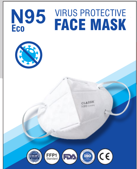
N95 Economy Face Mask