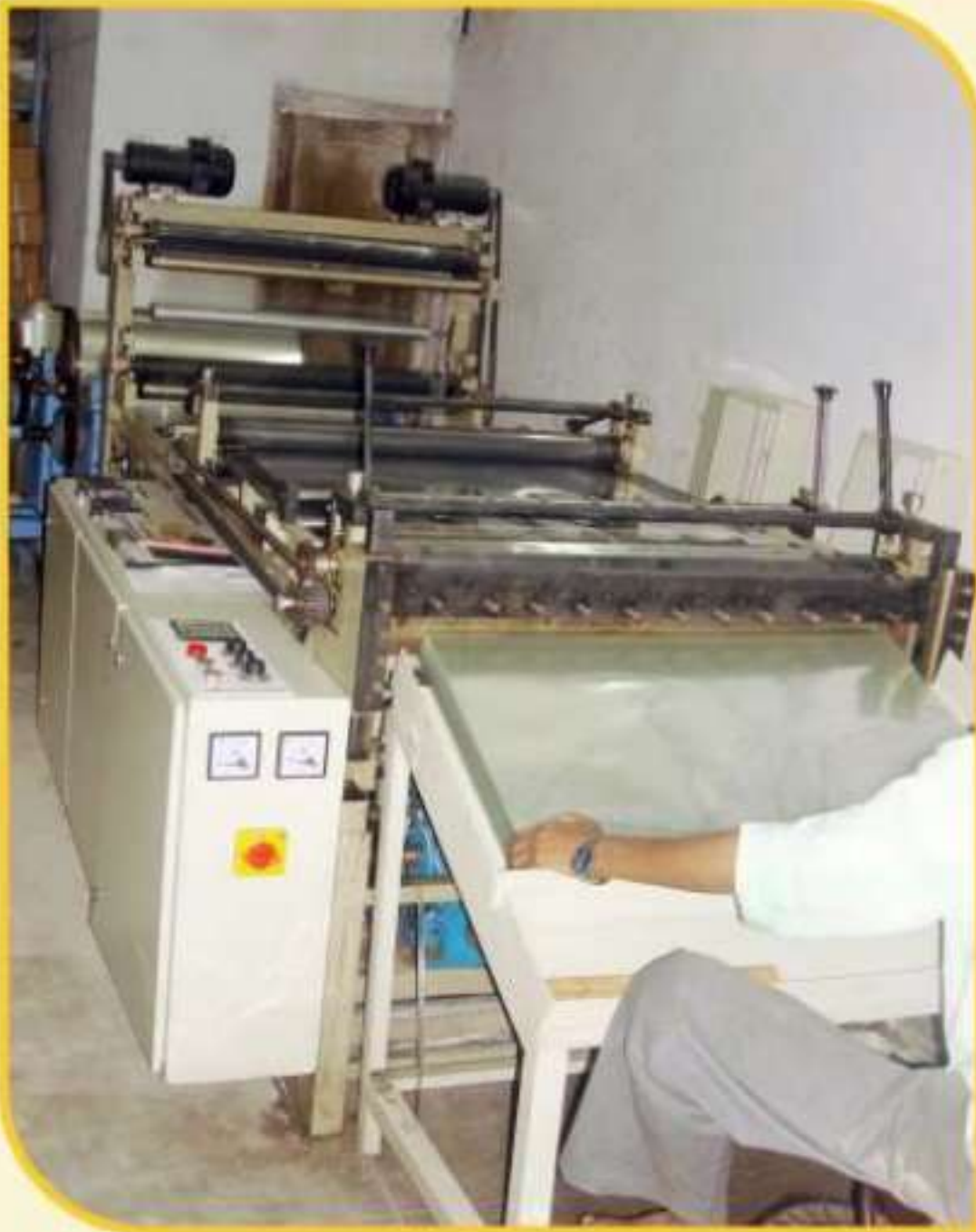
Sheet Cutting Machine