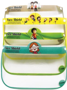
Kids Face Shield