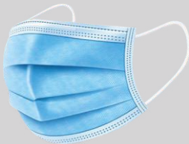
Surgical Face Mask