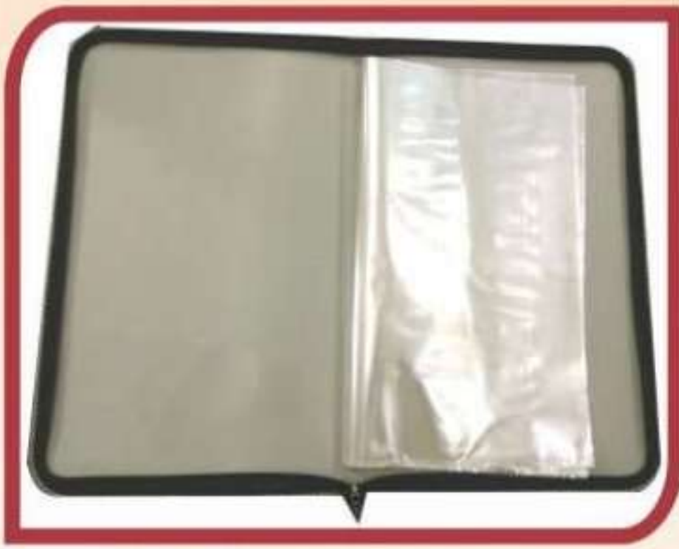
Display Zipper Bag