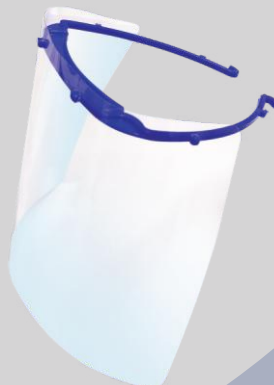
FS 141 (Economic & Small)