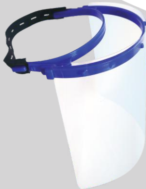
FS 161 (Movable)