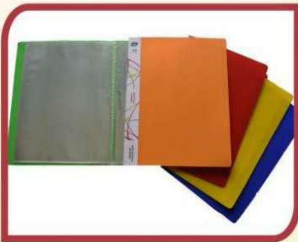
Display Folder File