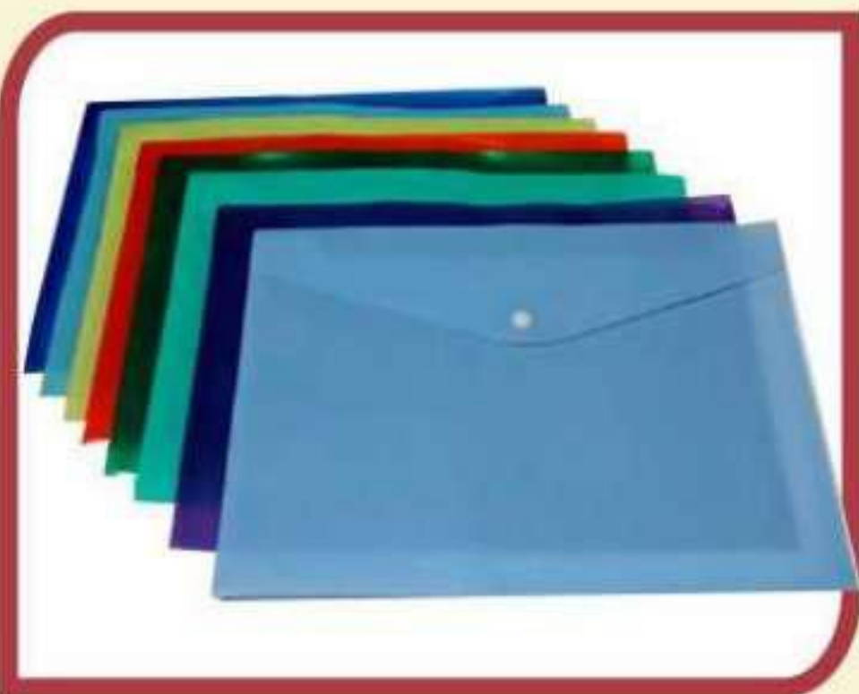
My Clear Bag