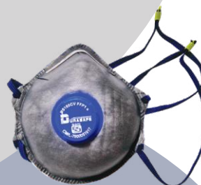
Cup Face Mask