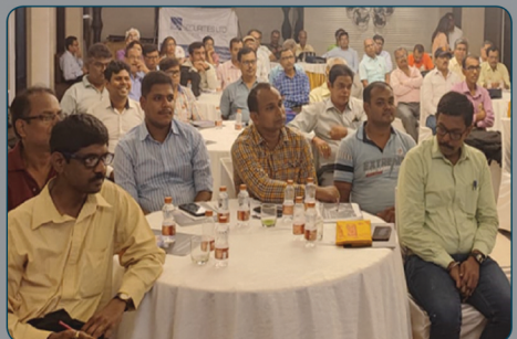
SKP Investor / Partner Awareness Meets Across Eastern Region