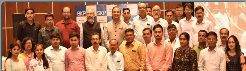
Fun @ Work @ SKP – Celebrating every occasion