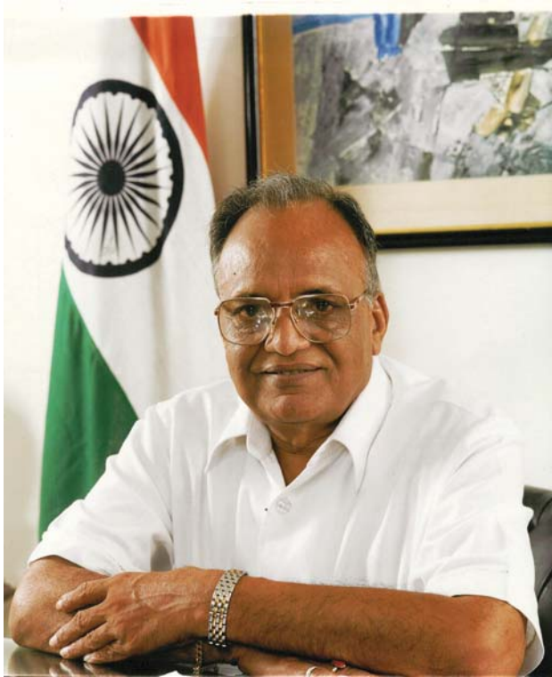
Shri O. P. Jindal August 7, 1930 - March 31, 2005 O. P. Jindal Group - Founder and Visionary

Only a few men are born to leave their mark upon the world. Shri O.P. Jindal was one of them. As a business leader he founded a global business conglomerate; as a parliamentarian he was a statesman extraordinaire, using his knowledge and power to bring succour to his countrymen. His footprints, the visionary trail, lights up the path for us and guide us in our quest to create a better world.