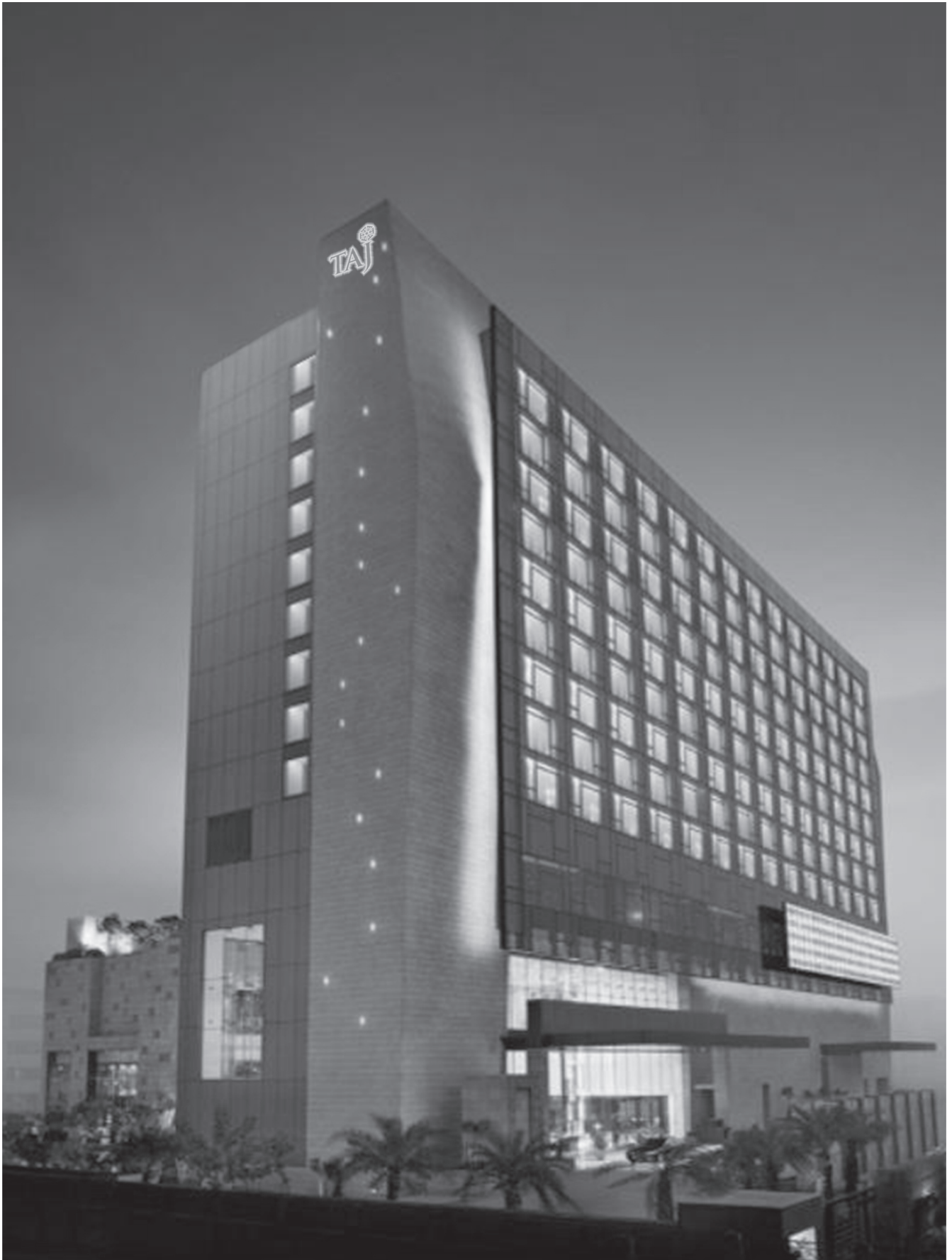
Company's Hotel Project- "TAJ CITY CENTRE - GURUGRAM" located at Plot No. 1, Sector 44, Gurugram, Haryana