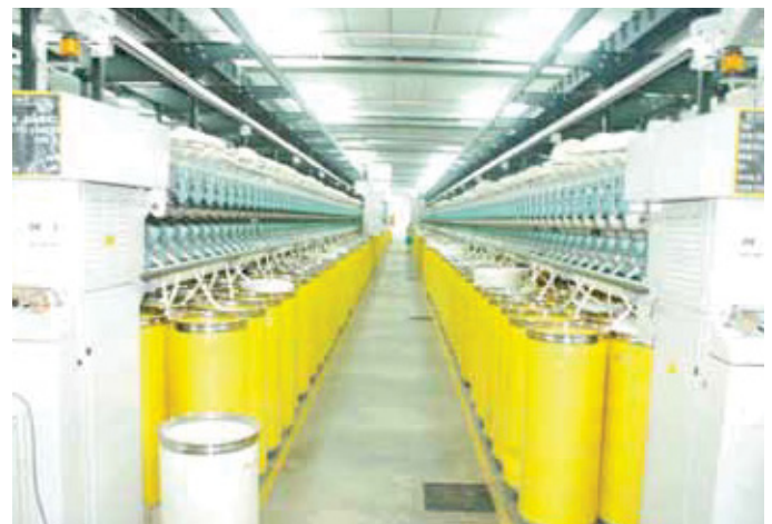
A view of fully Automatic Savio OE Spinning Machines with automatic piecing and cleaning facility installed at Rajapalayam Mills, Andhra Pradesh.