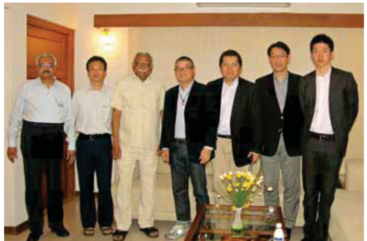
Our Chairman and President with the Officials from M/s. Mitsubishi Corporation & M/s. Nikko Textile, Japan during their visit to India.