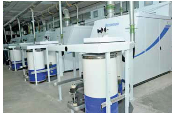
Newly installed Trutzschler Carding Machines at Rajapalayam Textiles (A Division of Rajapalayam Mills Ltd), Perumalpatti.