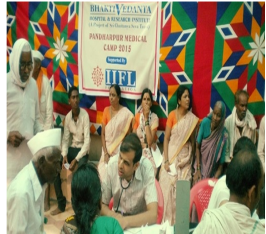
Pandharpur medical camp