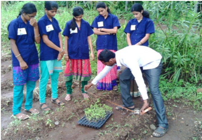
Krishi mitra – practical demonstration