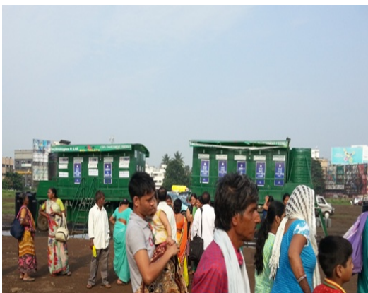
Environment friendly toilets, Nashik