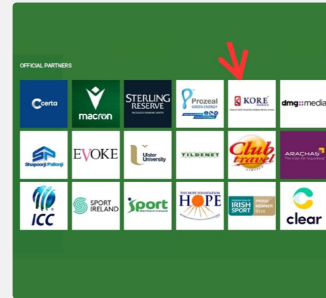
→ Press Release – Kore Mobile-India's Fastest Growing Mobile Retail Chain, Partners with Cricket Ireland: