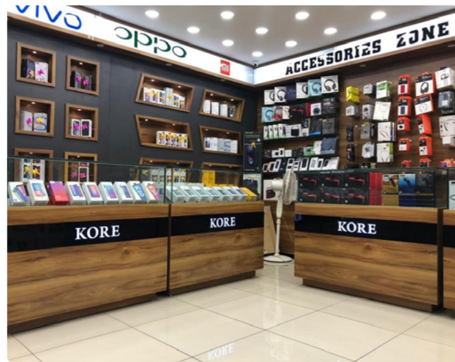
→ Kore Store