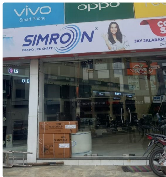
→ Simron Store