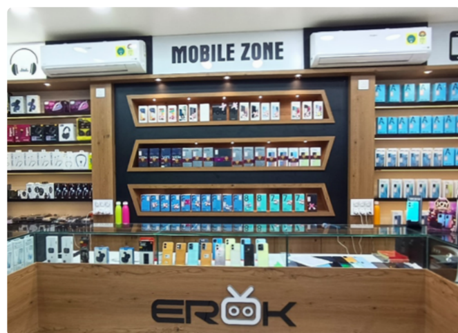
→ Erok Store