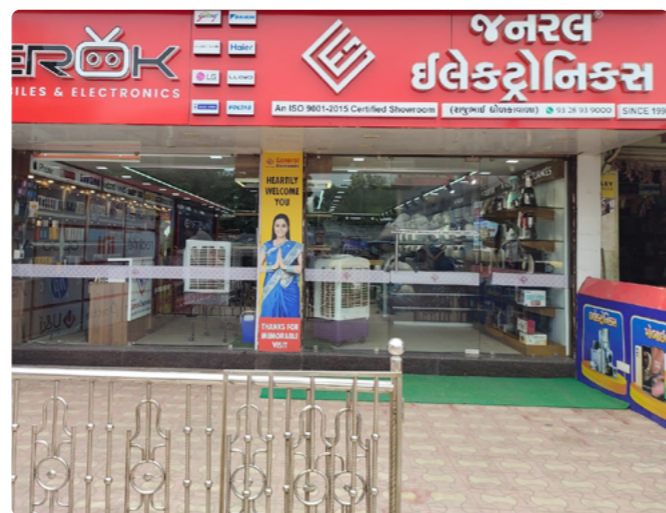
→ General Electronics