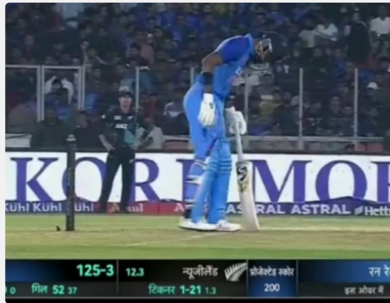
→ Cricket Stadium Advertisement IND vs NZ

The Company has taken the help of various social media platform like Twitter, Instagram, WhatsApp, Facebook, Aids in cricket matches, Print Media, Official Partner of the Ireland Men's Cricket Team during India Tour of Ireland T20 Series 2023, etc. for reaching the people across all demographics. The idea to have touch with people aimed at adding and associating more customers with our Company.