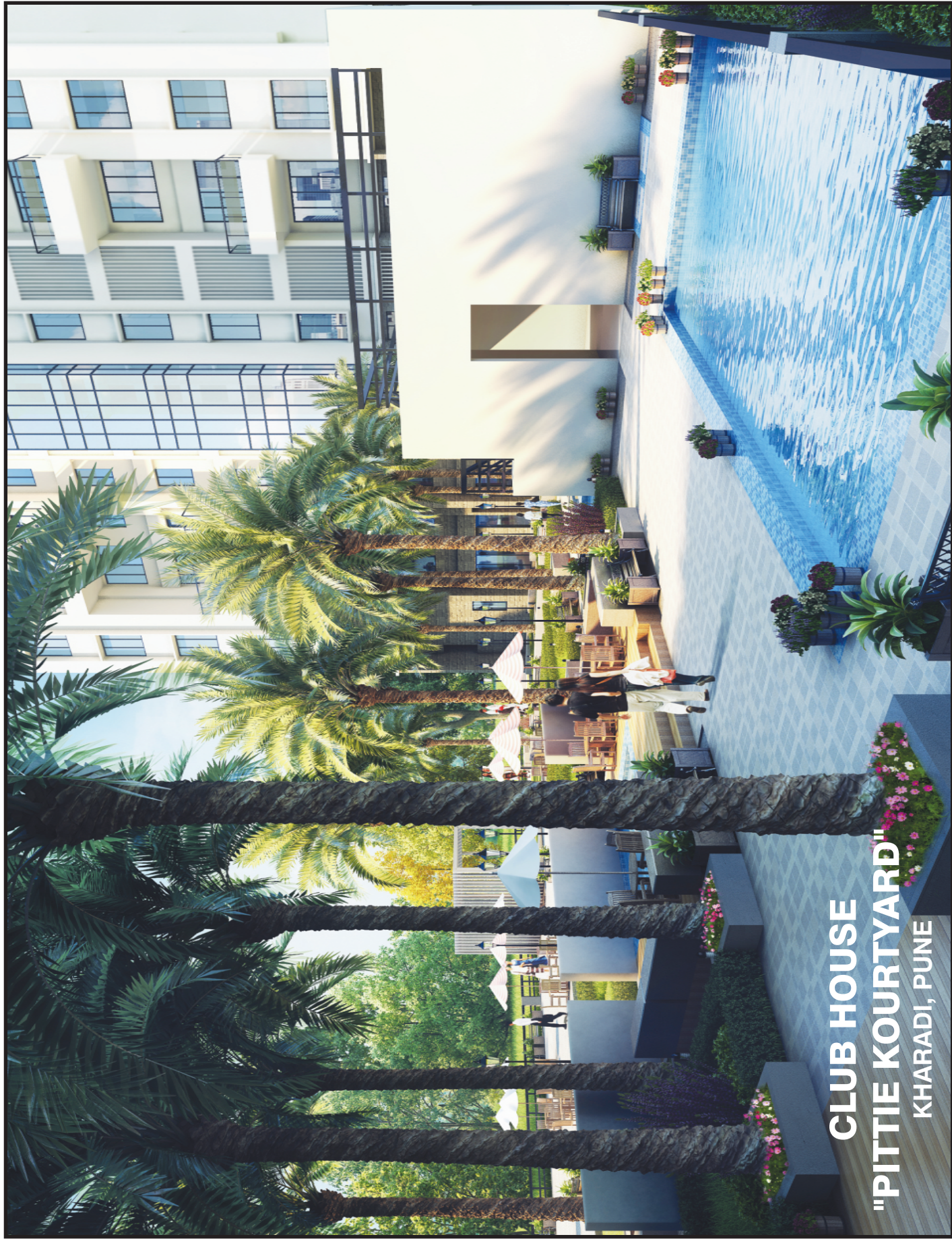
CLUB HOUSE "PITTIE KOURTYARD" KHARADI, PUNE