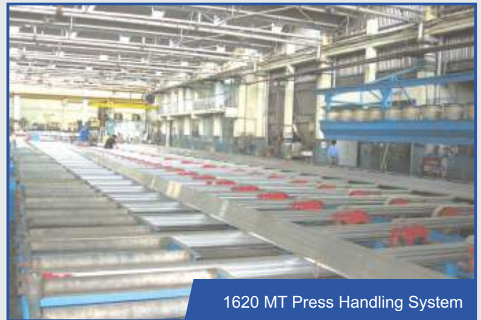
1620 MT Press Handling System