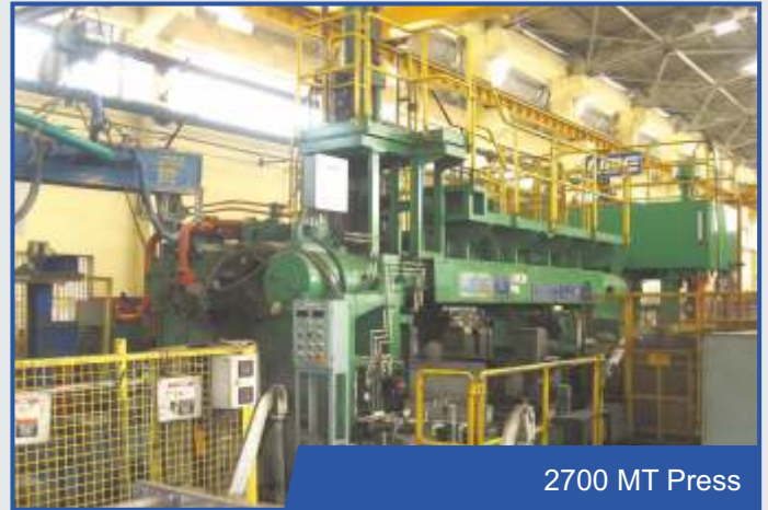
2700 MT Press