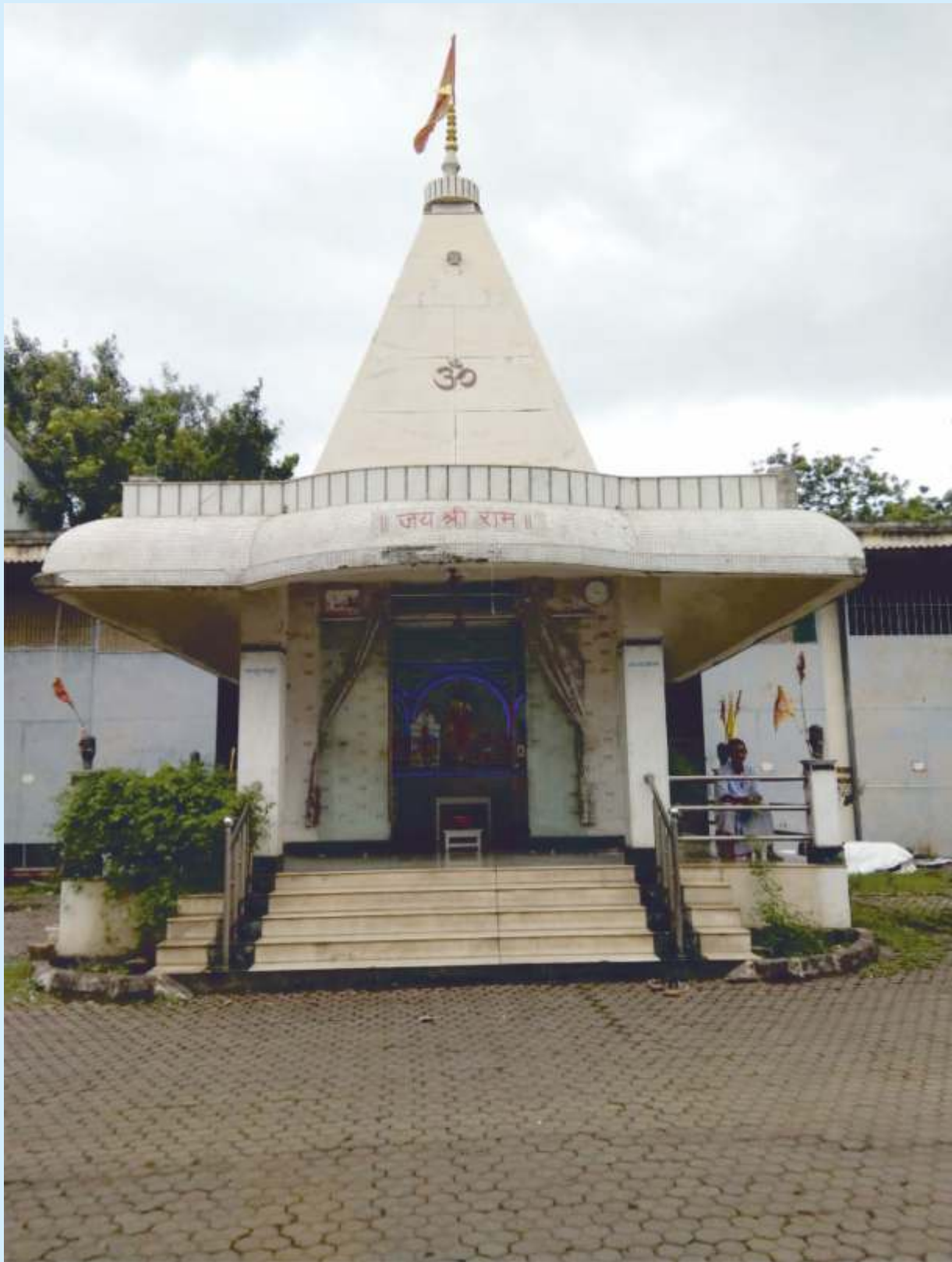
● CEL TEMPLE ●