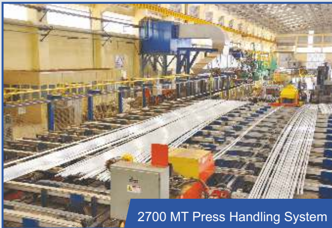
2700 MT Press Handling System