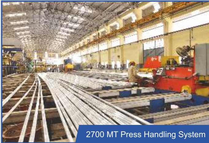
2700 MT Press Handling System