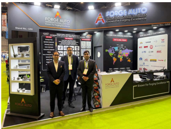
BAUMA CONEXPO (Delhi, India) 2024