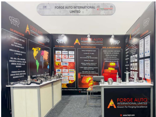
FARM & MACHINERY EXPO (Chandigarh, Punjab) 2025