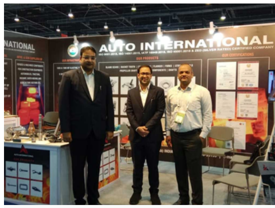
BAUMA CONEXPO (Delhi, India) 2023