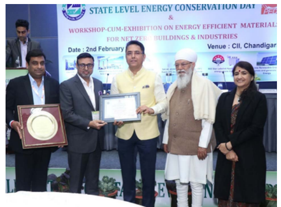
STATE LEVEL ENERGY CONSERVATION AWARD by PEDA (Punjab Energy Development Agency), 2022