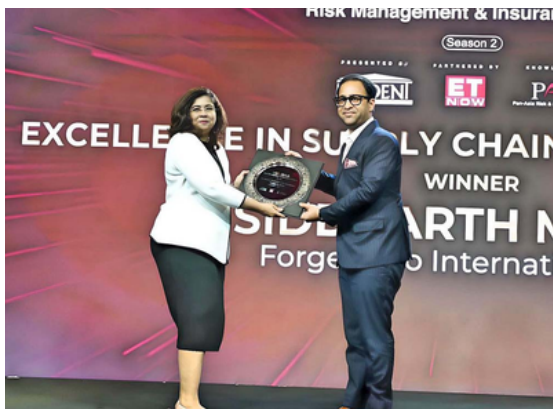
Supply chain Risk Management & INSURANCE AWARDS by Prudent and ET Now