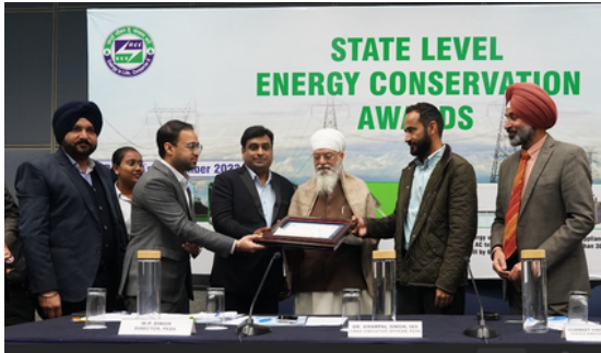
STATE LEVEL ENERGY CONSERVATION AWARD by PEDA (Punjab Energy Development Agency), 2023