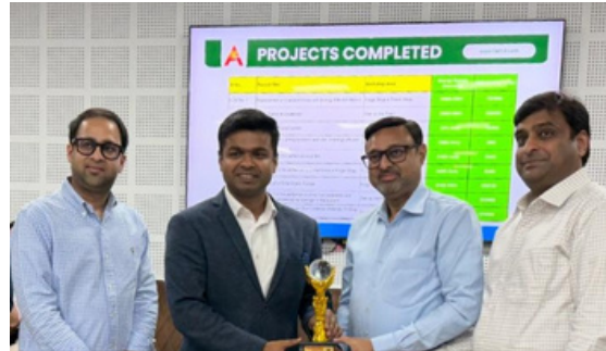
SUSTAINABLE AND GREEN MANUFACTURING PRACTICE By Chamber of Industrial & Commercial Undertakings (CICU) - Ldh.