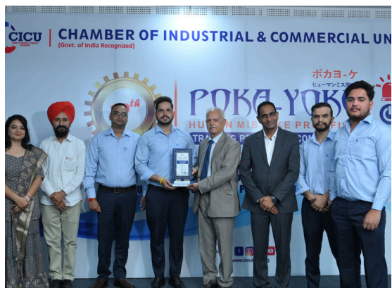
SILVER AWARD POKA-YOKE By Chamber of Industrial & Commercial Undertakings (CICU) in Cost Saving Category