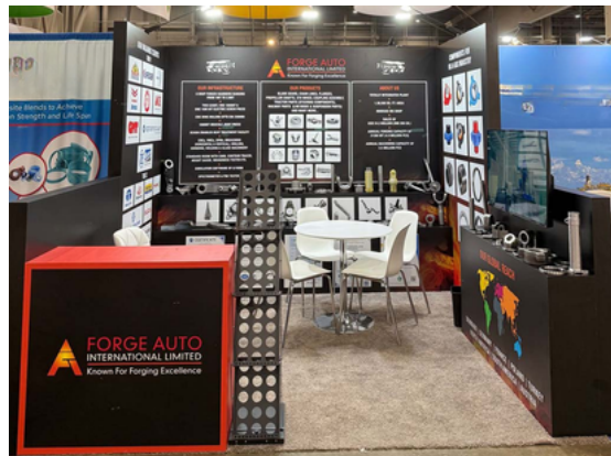
OFFSHORE TECHNOLOGY CONFERENCE (TX, USA) 2025