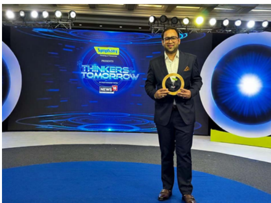
SYMPHONY - THINKERS OF TOMORROW by NEWS 18 Network in Automobile & OEM Category