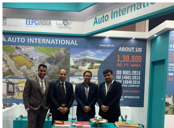
BAUMA CONEXPO (Delhi, India) 2023