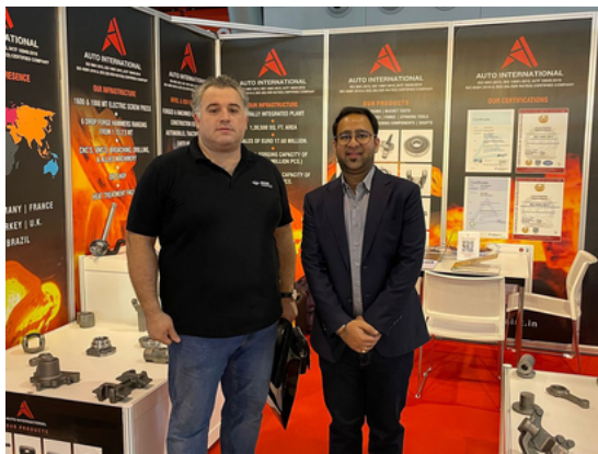
CastForge (Messe Stuttgart, Germany) 2022