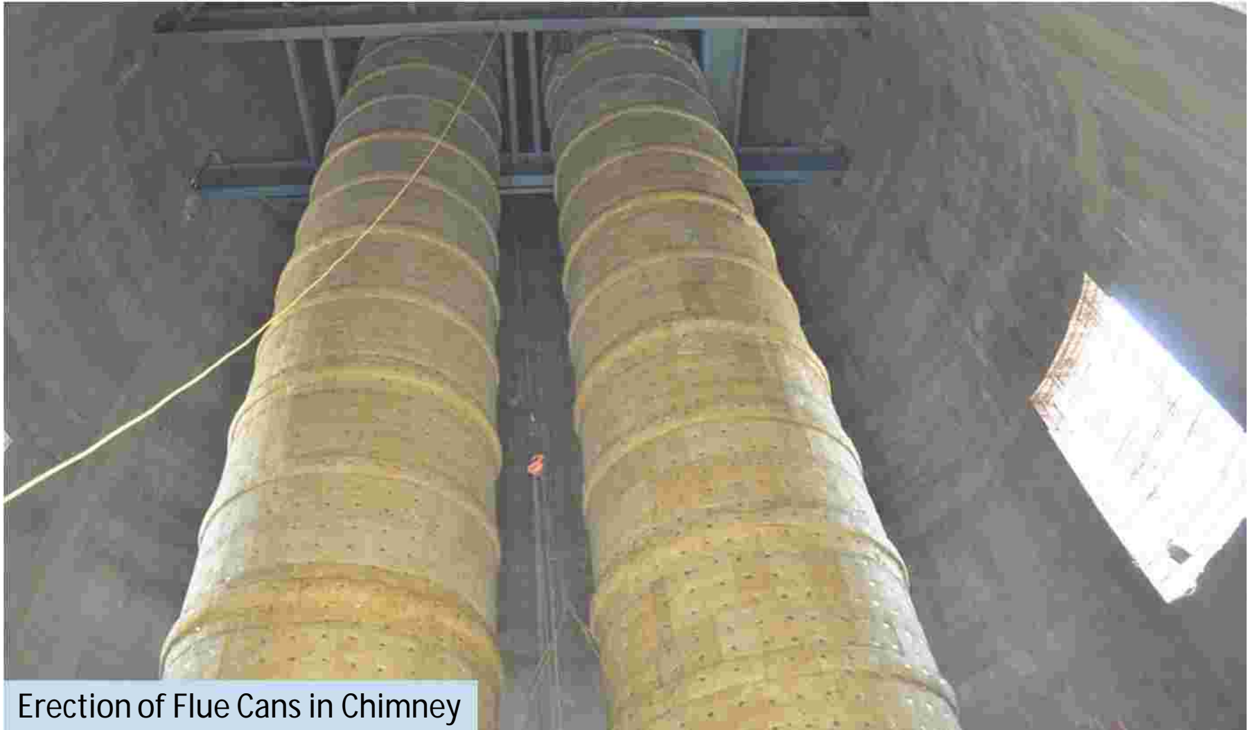
Erection of Flue Cans in Chimney