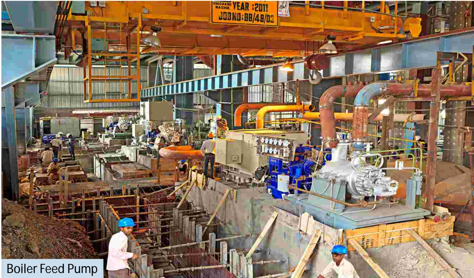
Boiler Feed Pump