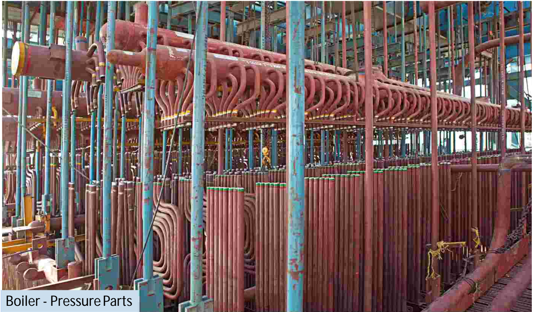
Boiler - Pressure Parts