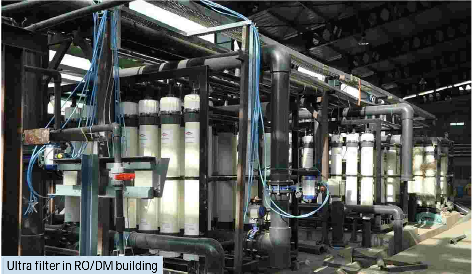
Ultra filter in RO/DM building