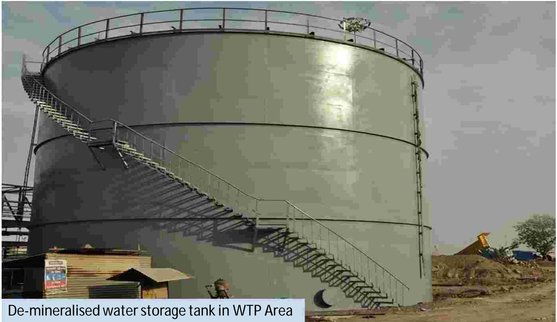
De-mineralised water storage tank in WTP Area