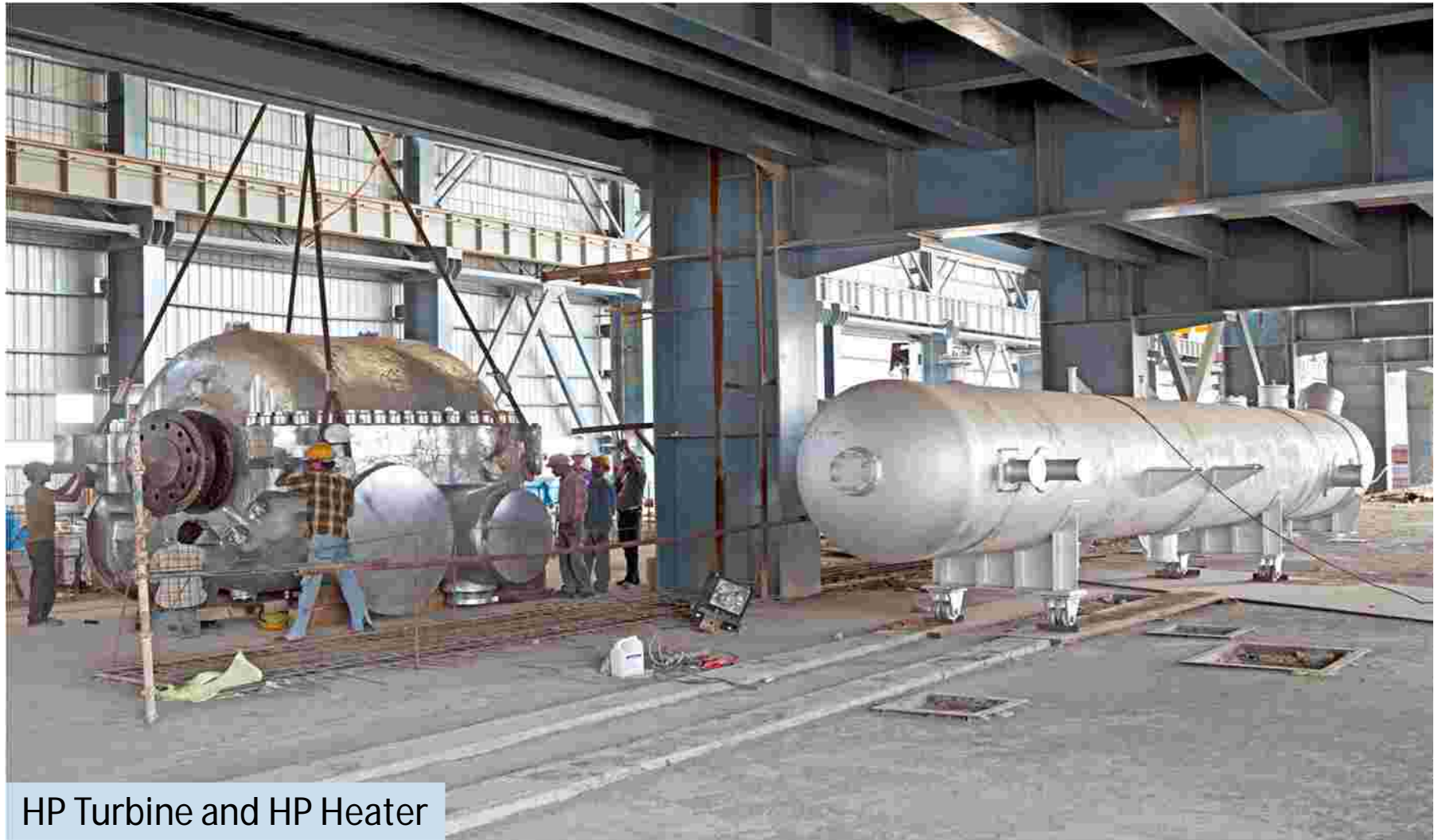
HP Turbine and HP Heater