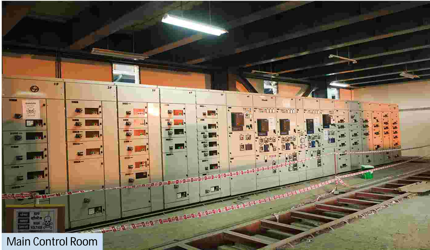
Main Control Room