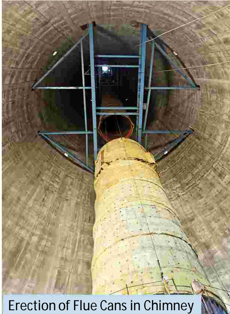
Erection of Flue Cans in Chimney