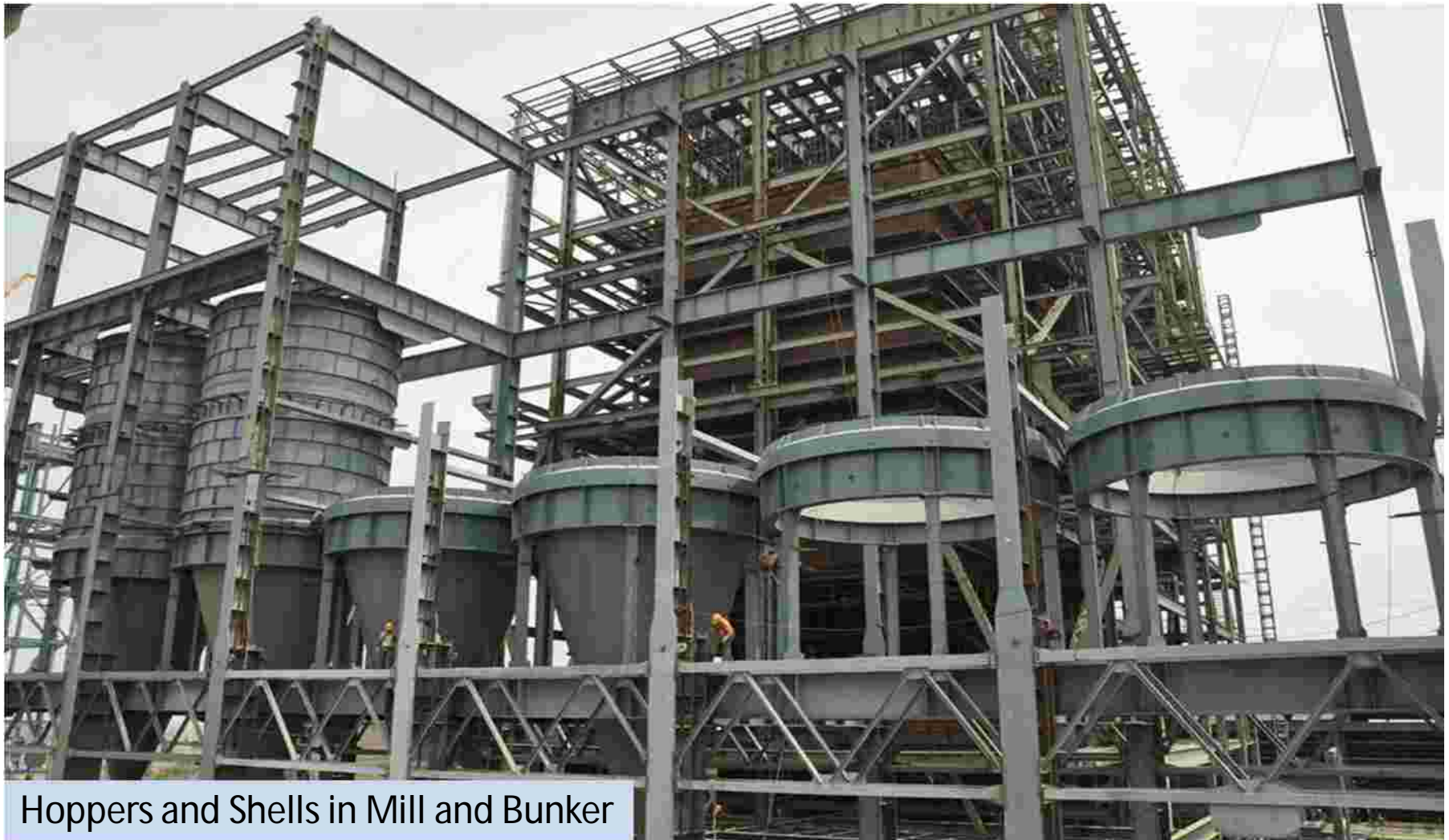
Hoppers and Shells in Mill and Bunker