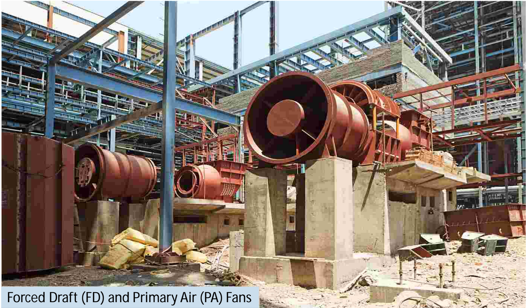
Forced Draft (FD) and Primary Air (PA) Fans