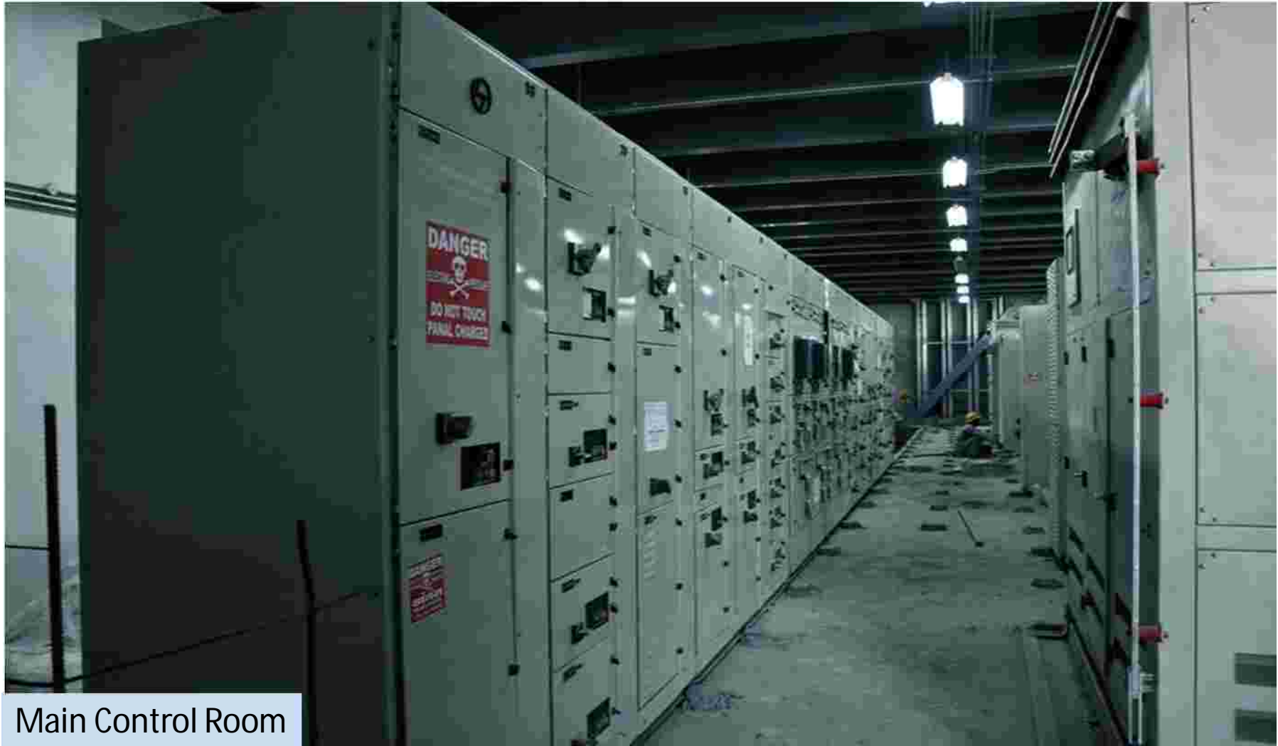
Main Control Room