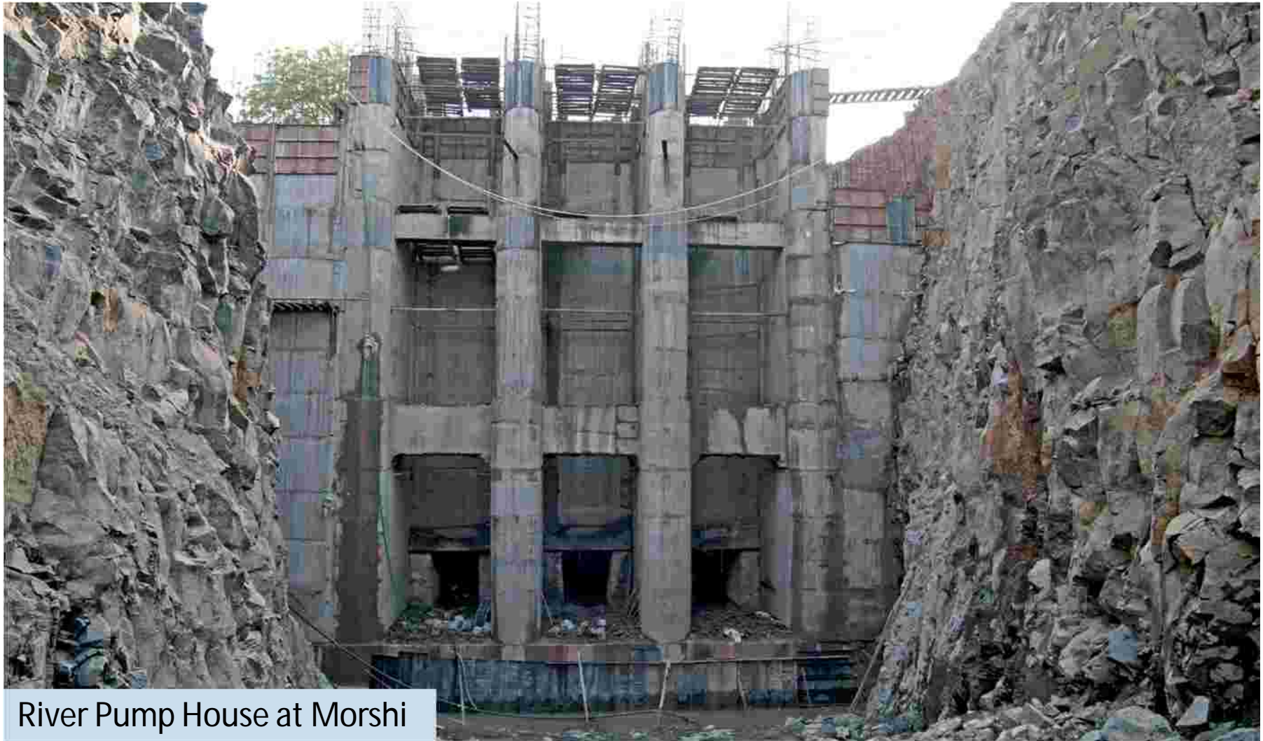
River Pump House at Morshi