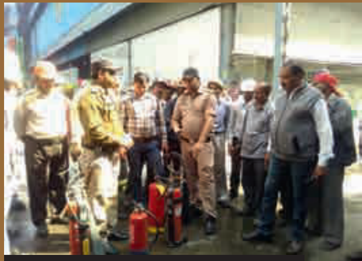
Mock Drill & Practical Fire Fighting Training