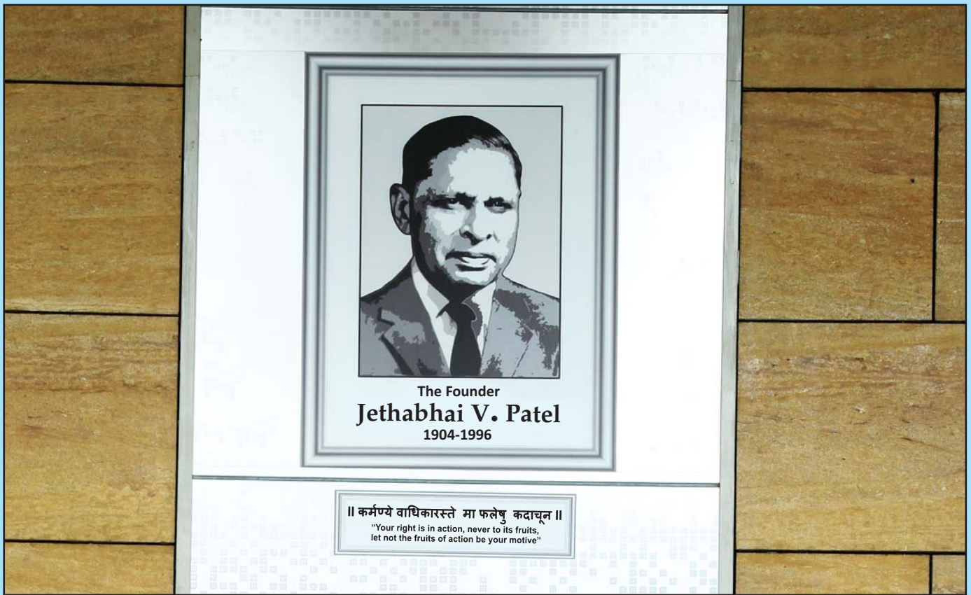
At reception of IT building no. 3