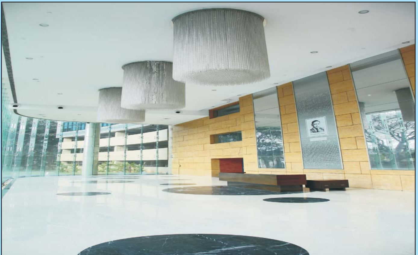
Entrance Lobby of IT building no. 3