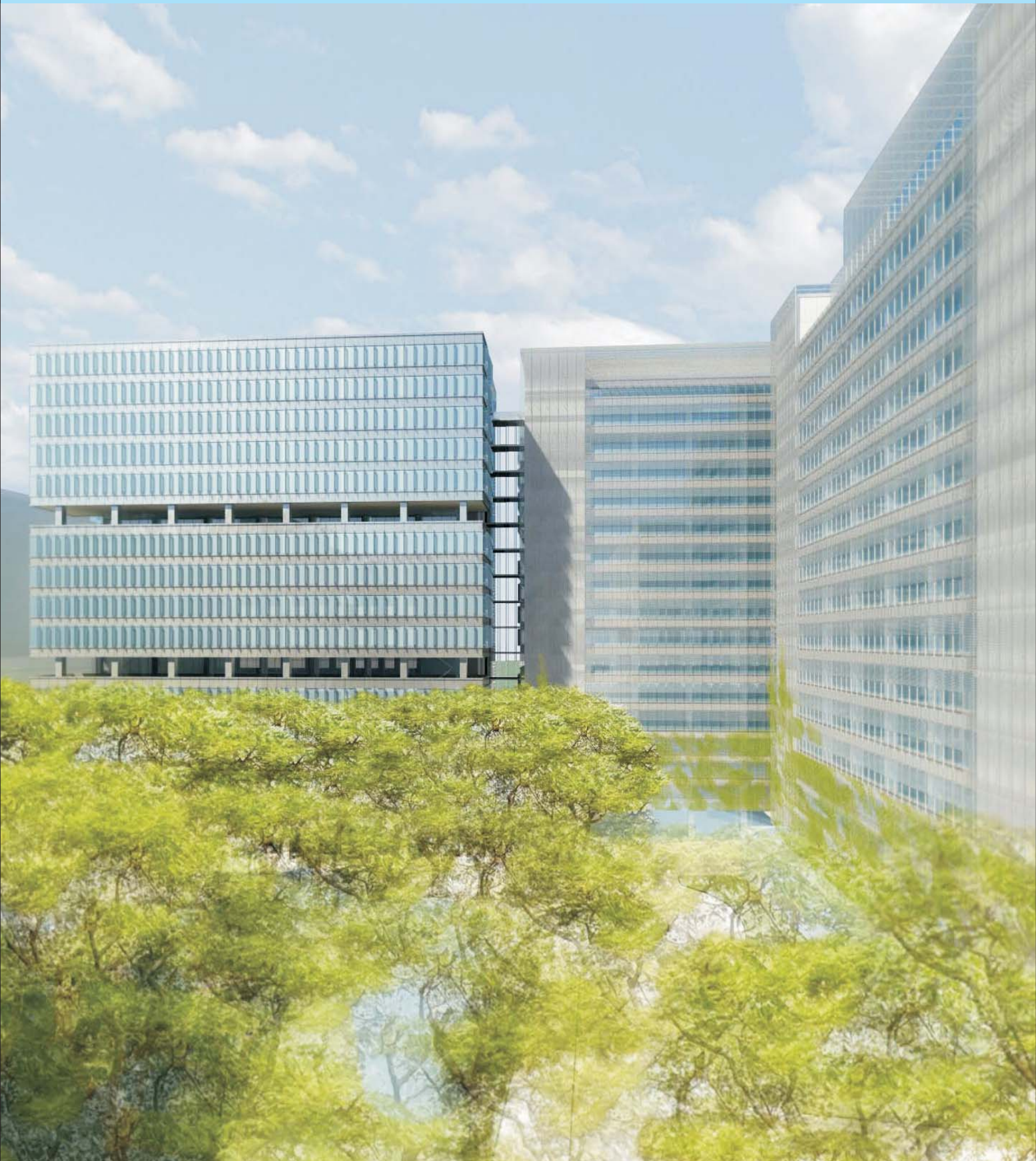
Frontage of proposed IT building no. 4 with three wings