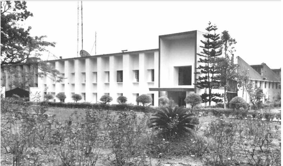
SNL Factory Building at Ranchi