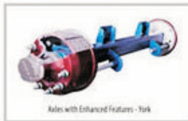
Axles with Enhanced Features - York