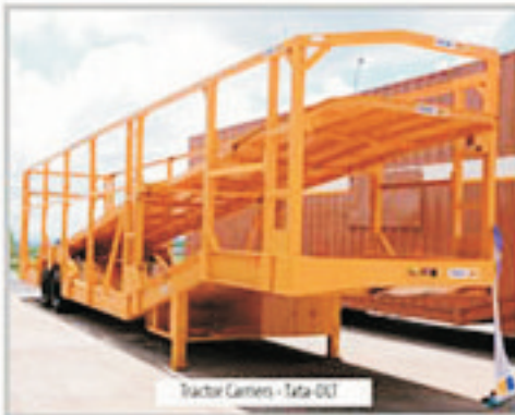
Tractor Carriers - Tata-DOT