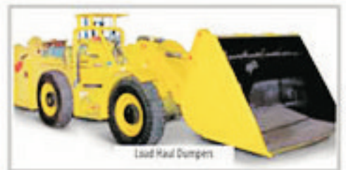
Load Haul Dumpers