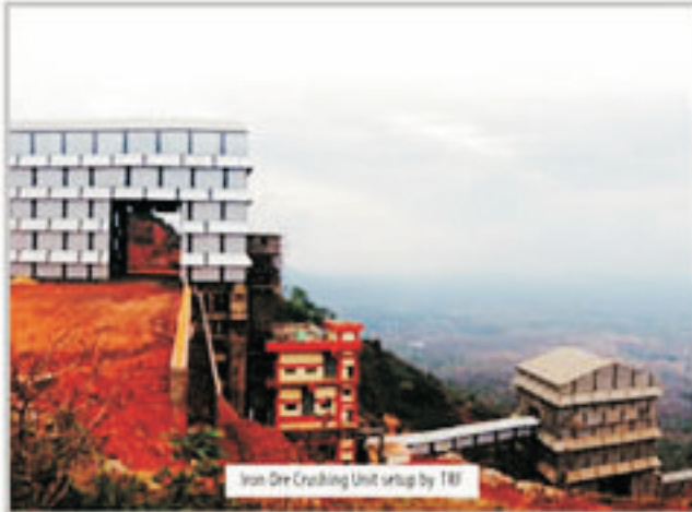
Iron Ore Crushing Unit setup by TRF