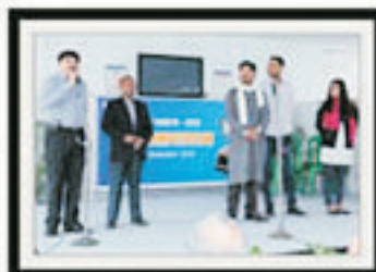
Skill on Quality