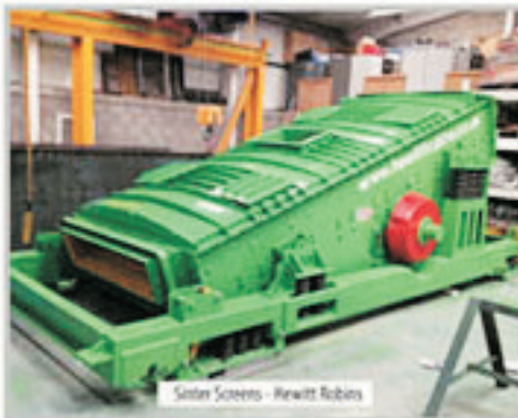
Screen Screens - Riwatt Robins