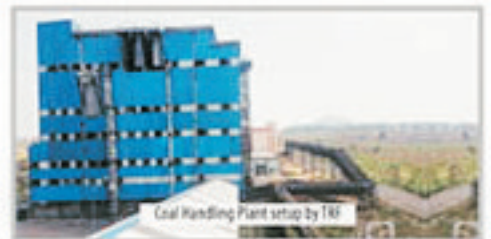
Coal Handling Plant setup by TRF