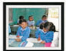
*TRFLA's Nishat School