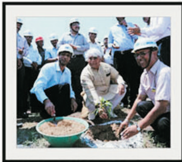
Tree Plantation on World Environment Day