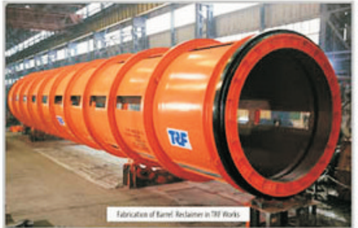
Fabrication of Barrel Reclaimers in TRF Works