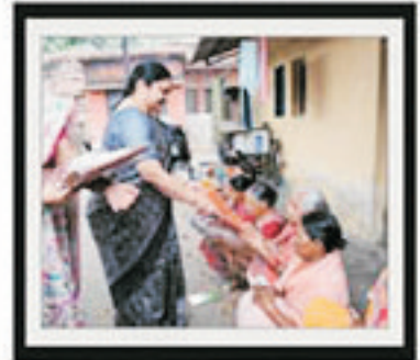
Donating Clothes on Int'l Women's Day