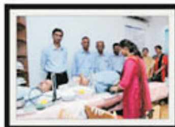
Nayevan- Blood Donation Camp