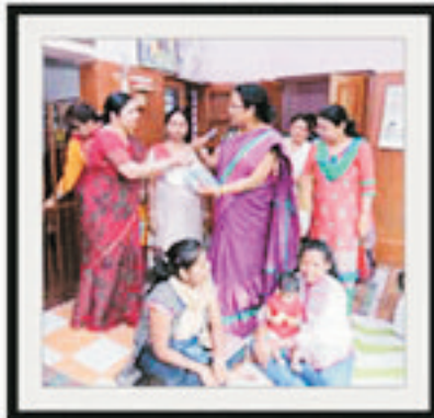
Volunteering at an Orphanage