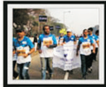
Walkathon at Kolkata