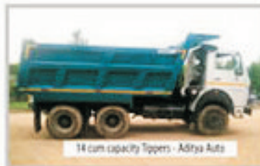
14 cum capacity Tippers - Aditya Auto