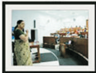
Awareness on Sexual Harassment