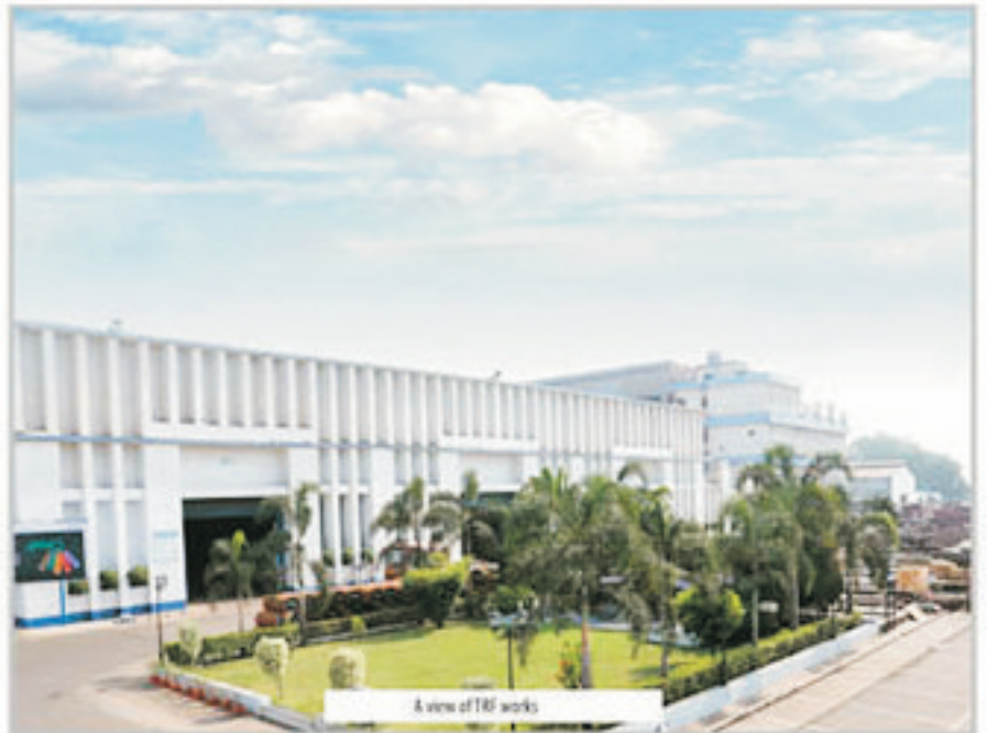
A view of TRF works