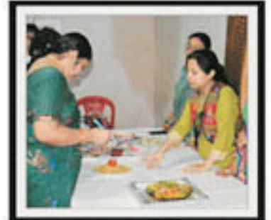
Cooking Contest by TRF Ladies Association*