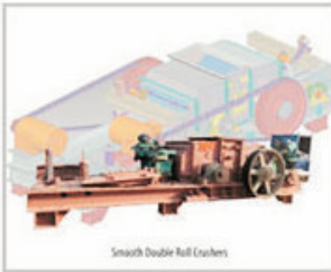
Smooth Double Roll Crushers